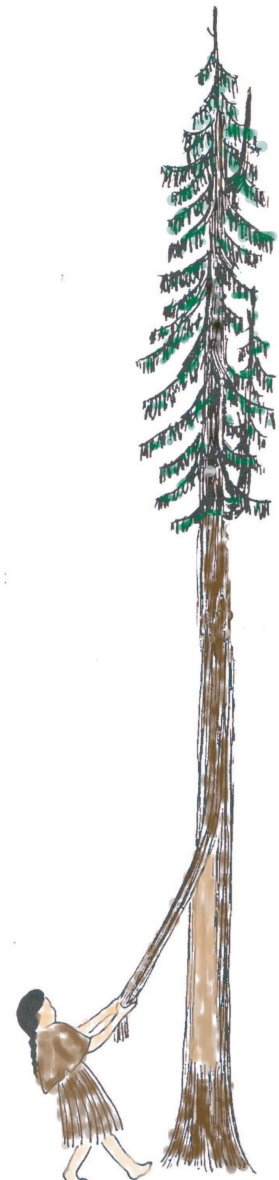
Woman pulling a strip of bark from western redcedar.