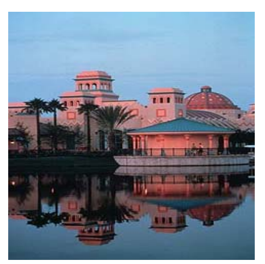
Disney's Coronado Springs Resort

In addition to its world class beaches, the Westin Resort also has over 10,000 square feet of indoor meeting and function space, in addition to its beach-side, tented Palm Terrace which "is ideal for receptions and dinners." <sup>12</sup>