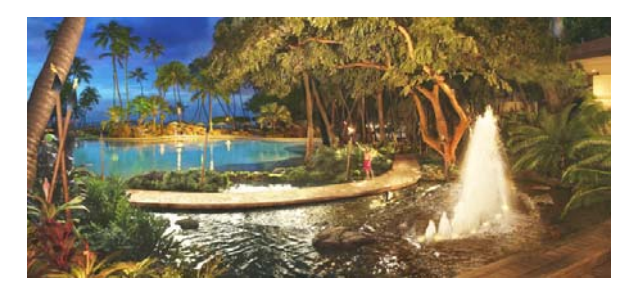
Hilton Hawaiian Village Resort

On May 9-12, 2006 the Federal Asian Pacific American Council (FAPAC) hosted it 21<sup>st</sup> Annual Congressional Seminar/National Leadership Training Conference in Honolulu. In follow-up responses to Congressional inquiry, USDA defended its participation at the resort