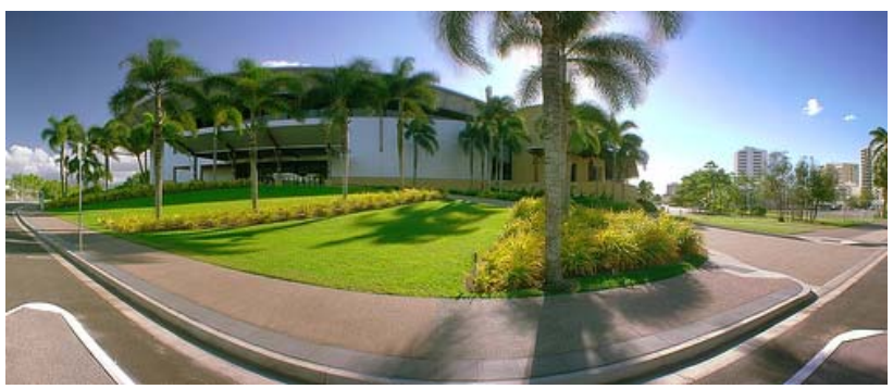
Cairns Convention Centre

According to conference organizers, the event was the first held in the Southern Hemisphere, an area of the world "whose scientists have made great contributions to many fields of Mycology." And the location itself, Cairns, "enjoys close ties with the Asia Pacific region. With its combined World Heritage listed attractions of the Great Barrier Reef and the Wet Tropic Rainforests, Cairns offers a uniquely tropical experience to visiting mycologists from around the world. As a very attractive Australian and international tourist city, Cairns offers holiday style accommodation located centrally to shops, restaurants, theatres, galleries and tropical beaches. The congress will be held at the very modern and spacious Cairns Convention Centre."