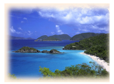
Westin St. John Resort & Villas