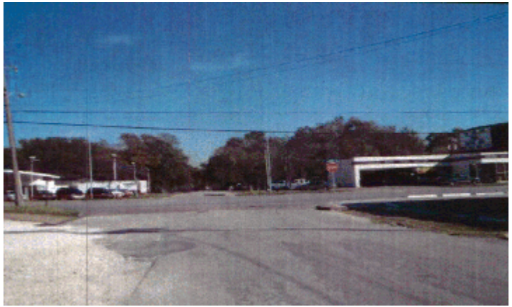
Duluth Street and Uvalde Road