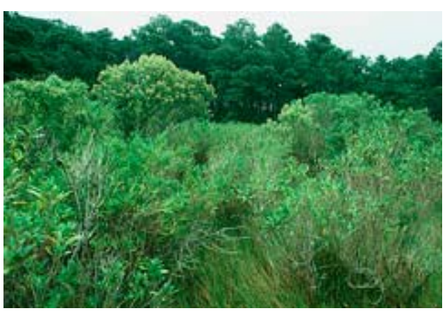
Virginia Department of Conservation and Recreation Scrub is a rapidly declining habitat.

Well-managed scrub-shrub habitats are critical for birds. Scrub-shrub includes many flowering plants that provide nectar, seeds, and insect foods needed by breeding birds. Tall herbs and grasses growing on the edge of shrubland offer shelter and nest sites, as well as hunting areas for predatory birds such as barn owls and kestrels. In agricultural areas, scrub-shrub can be implemented or maintained to buffer adjacent wood-