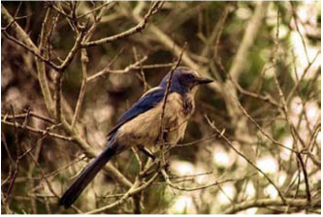
U.S. Fish & Wildlife Service

Frequent or poorly timed treatments may reduce the attractiveness and suitability of ROWs and idle land around residential areas for scrub-shrub birds. Ground near residential areas is frequently mowed to maintain a neat appearance, even when opportunities exist to convert these areas to suitable wildlife cover.