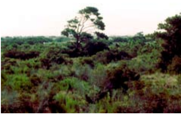
U.S. Geological Survey

Old field habitats result when pastureland is abandoned or cropland is retired. Old field succession proceeds from meadow to scrub-shrub to woodland. Meadow consists mostly of various native grasses and forbs (broad-leafed flowering plants). As succession progresses and the meadow is increasingly dominated woody plants, the scrub-shrub stage of an old field develops. If woody plants larger than 4 inches in diame-