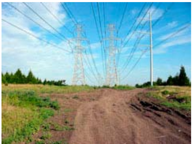
Preservation Society for Spring Creek Forest