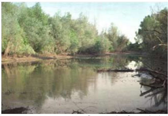
Sacramento Area Conservation Area

Shrub wetlands provide a habitat for a variety of wetland birds. These habitats are characterized by brushy, woody plants not growing more than 20 feet high.