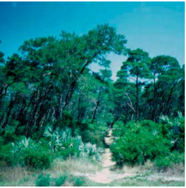
South Florida Water Management District

Habitat use by scrub-shrub birds is highly complex. Vegetation structure may influence habitat use to a greater extent than plant species composition. So, bird species richness is likely to be greatest in stands of mixed species with different growth forms. Mixed species stands support a wider range of invertebrates and produce a greater variety of fruits; hence, they may provide enhanced foraging opportunities for birds. Most fruit-eating birds will feed on a range of shrub species, but food selection is influenced by availability of fruits in the area. Invertebrate density can also vary with structural complexity.