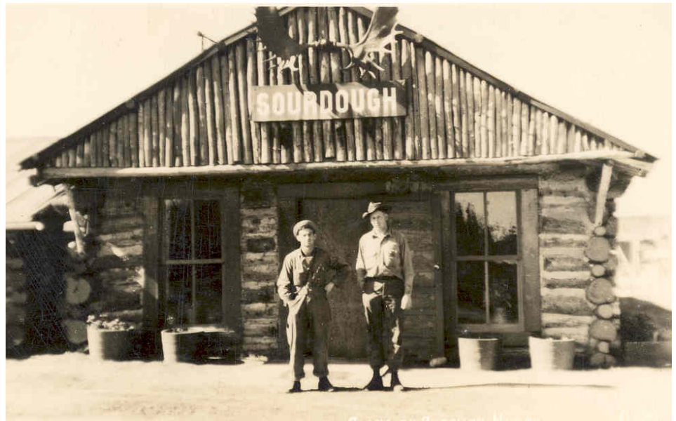
The old Sourdough Roadhouse was one of the earliest facilities built to aid travelers along the trail north out of Valdez. It began in 1903 and stood near BLM's Sourdough Creek Campground until burning Dec. 27, 1992.