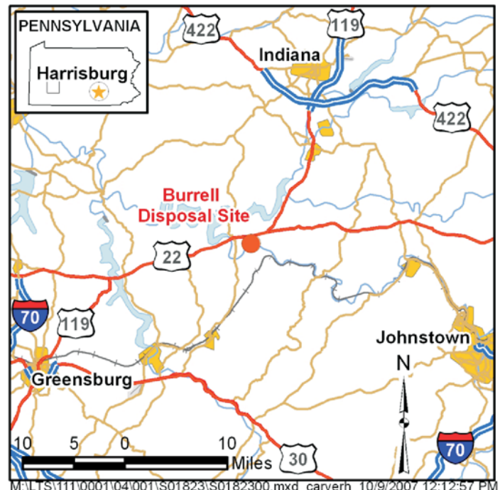
Location of the Burrell Disposal Site

Congress passed the Uranium Mill Tailings Radiation Control Act (UMTRCA) in 1978 (Public Law 95-604), which required the cleanup of 24 inactive uranium ore processing sites. DOE remediated these sites under the Uranium Mill Tailings Remedial Action Project in accordance with standards promulgated by the U.S. Environmental Protection Agency in Title 40 Code of Federal Regulations (CFR) Part 192. Subpart B of 40 CFR 192 regulates cleanup of contaminated ground water at the processing sites. The radioactive materials were encapsulated in U.S. Nuclear Regulatory Commission-approved disposal cells. The U.S. Nuclear