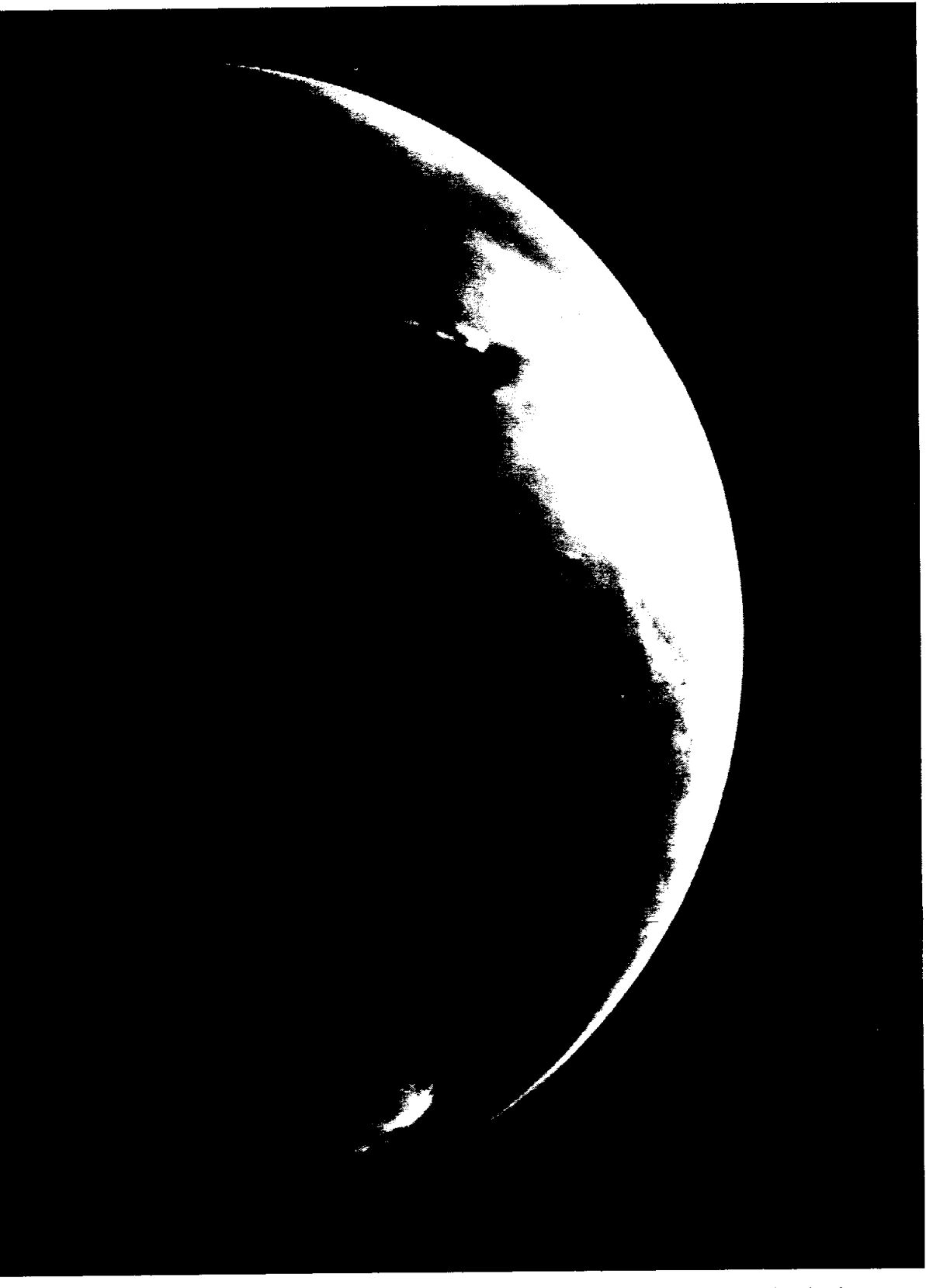
Viking 2 captured this striking view of Mars during its approach in August, 1976. Bright plumes of water ice clouds stream a considerable distance northwestward from the western flank of Ascreaus Mons, one of the three major volcances aligned on the Tharsis bulge of Mars. Below, another of those Tharsis volcances, Arsia Mons, is shown in a three-dimensional perspective generated by computer with the help of Viking image, contour and terrain data. The view is from the southwest, 25 degrees above the horizon. Arsia Mons rises 15 kilometers above the surrounding plain with a cone 400 kilometers in diameter.