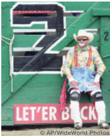
(above) A rodeo clown dressed in colorful protective gear awaits his turn in the ring.