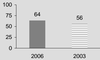
Index - % Top Two Box