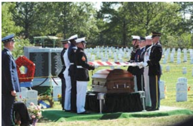
VA provided a Pentagon-shaped granite headstone to mark a gravesite at Arlington National Cemetery containing the remains of victims of the 9-11 attack.