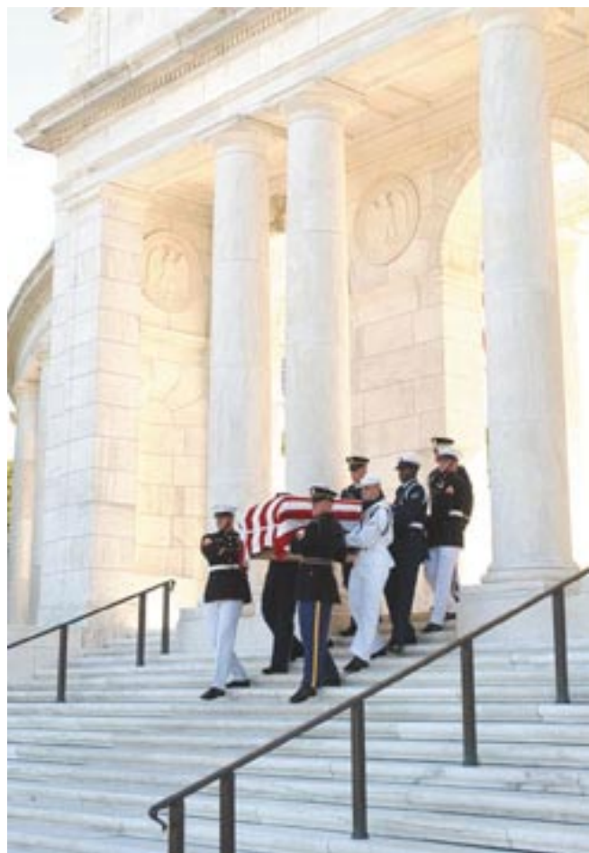
An Honor Guard bears the casket containing remains of 9-11 victims during a funeral service held in the cemetery's amphitheater.

Secretary of Defense Donald H. Rumsfeld, who was in the Pentagon at the time of the attack, expressed the nation's sympathy, saying, "Our country shares your sorrow and mourns your loss." The service and group burial held special meaning for the families of five victims whose remains were never positively identified. VA