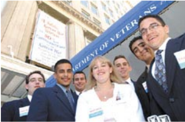
Youth volunteers from all over the country came to Washington to brainstorm strategies the Department can use to attract more of their peers to volunteering.

ship. They came to VACO to brainstorm strategies the Department can use to attract younger volunteers. Their ideas included establishing student volunteer committees at VA hospitals to focus local efforts, partnering with schools to conduct recruitment drives, and making sure young volunteers feel as though they are part of the VA team.