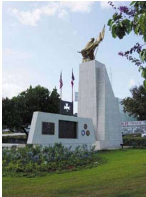
El 65avo. Monumento de Infantería en San Juan.

enviados a retaguardia para gozar de un período de “R&R”, lo que significa en el ejército descanso y relajación. No bien se asentaron, la unidad sufrió un ataque de las tropas norcoreanas. Fue un gran error de parte del enemigo. Cuando se callaron los disparos, el Regimiento N° 65 había aniquilado a más de 600 soldados enemigos y había