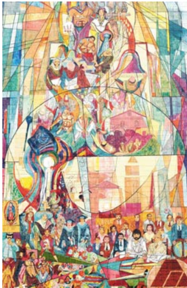
Colorful murals like this one outside the vet center are a signature feature of East Los Angeles.

stories. She wasn't about to let that happen.