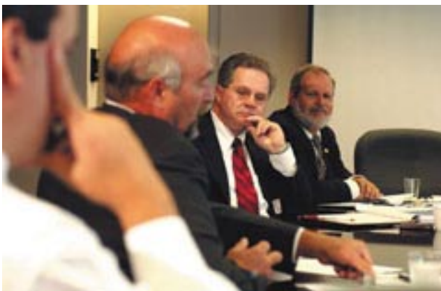
Disabled veteran entrepreneurs share their perspectives on how VA can do a better job of awarding contracts to businesses owned by service-disabled veterans.

"I'm embarrassed and quite honestly, disappointed, in our performance," admitted Secretary Anthony J.