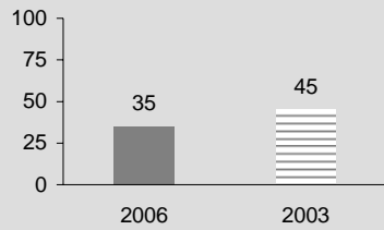
Index - % Top Two Box