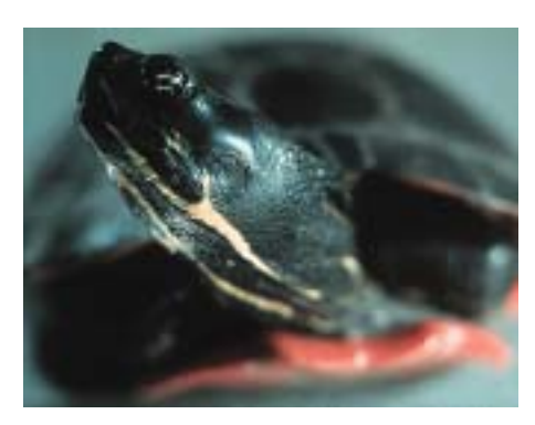
Plymouth redbelly turtle

Plymouth Redbelly Turtle (Pseudemys rubriventris bangsi) For the past 15 years, Massachusetts state naturalists have nurtured thousands of tiny Plymouth redbelly turtles through their first year of life in captivity, then released them into the wild under the state's "head start" program. The naturalists have searched unsuccessfully over the past 5 years for evidence that any of these head-started turtles were reproducing in the wild. Finally, in early June of 2000, a female head-started turtle was found heading back to her pond after just laying her eggs and burying them. This was the first known nesting of a released turtle since the head start program began. So far, the program has resulted in the release of 1,500 to 2,000 Plymouth redbelly turtles over the past 15 years.