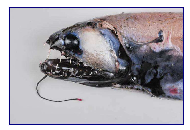
Fig. 7. Stareater showing the sharp curved teeth and red luminous lure