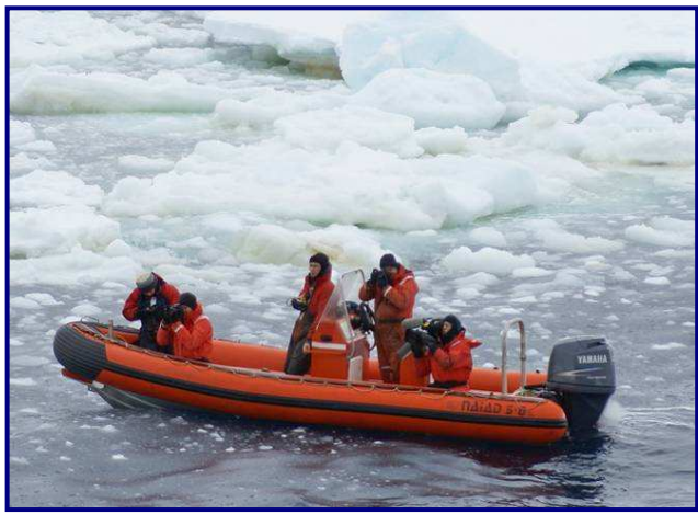
Fig. 4. The documentary team filming Tangaroa , working in heavy ice.