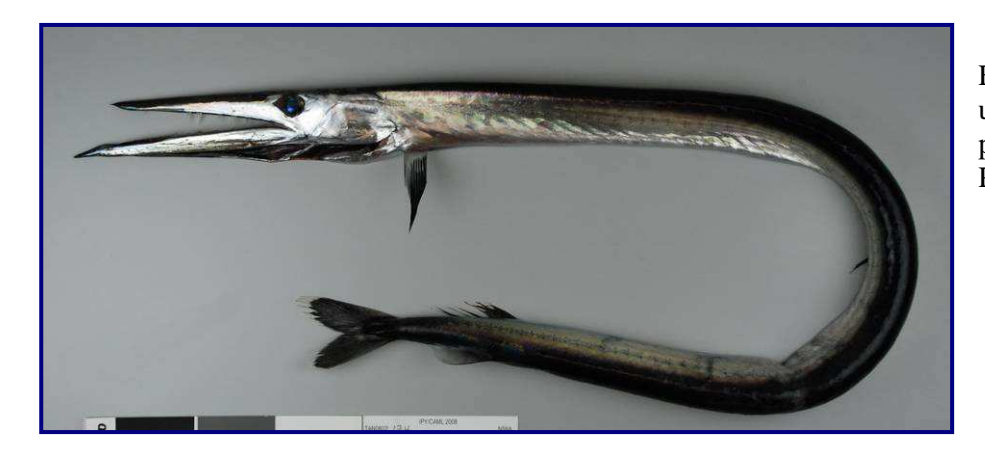
Fig. 6. Daggertooth set up for specimen photography

The stareater is another midwater predator. Smaller and more fragile than the daggerfish it is believed to capture its prey by luring small fishes into striking range with its red luminous chin barbel. The delicate fins and skin on this specimen were abraded by the net, but all important key features remained. These include the row of light organs along the belly (seen as black dots on Fig. 7); the mouth with its long, slender, curved teeth; and the lure. This 21 cm long specimen is about as big as this species gets. Scientists are unsure as to exactly how many species of stareater there are.