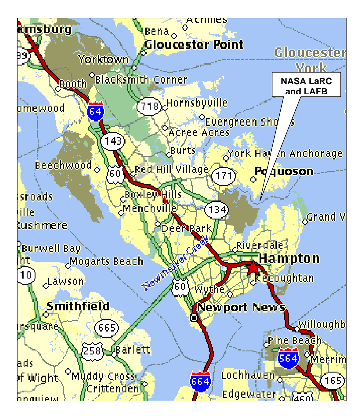
Figure E-1: Vicinity Map