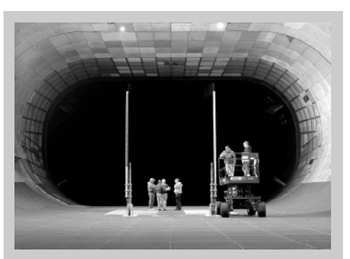
Engineers and technicians prepare for a calibration check on strain gauges and accelerometers on antennas in the 40-by-80-foot Wind Tunnel.