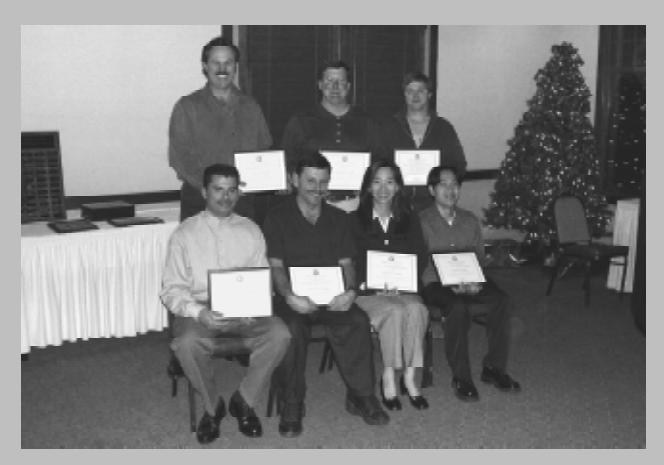
Members of the TRAM technical support team

Code FOI and FOW technicians and mechanics who supported the full-span Tiltrotor Aeroacoustic Model (TRAM) test in the 40-by-80-foot Wind Tunnel have been honored by the American Helicopter Society. The society's San Francisco Bay Area Chapter presented them with its annual Outstanding Technical Support Award in December.