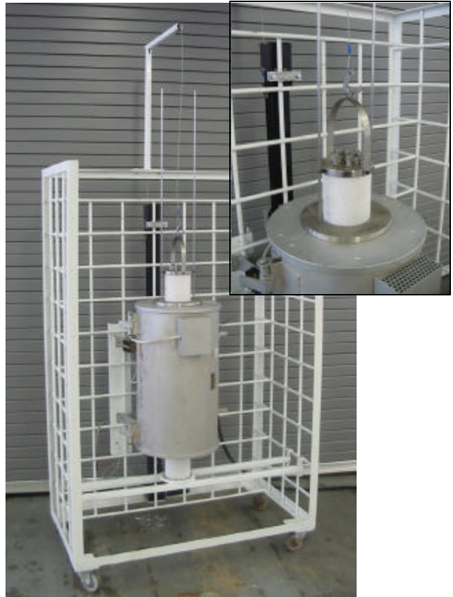
Fig. 1: Cyclic oxidation apparatus.

The TGA tests in steam provide information on the mechanism of oxidation in terms of kinetics and activation energies. The apparatus is shown in Fig. 2. A single sample is suspended from a balance into a vertical tube furnace. Steam is injected into the base of the tube furnace with a metering pump. It is condensed and collected from a side port above the furnace. A dissolved oxygen (DO) sensor measures the oxygen content of the input water. Bubbling nitrogen gas through the input water, containing a known percentage of oxygen, fixes the input water at a particular DO content.