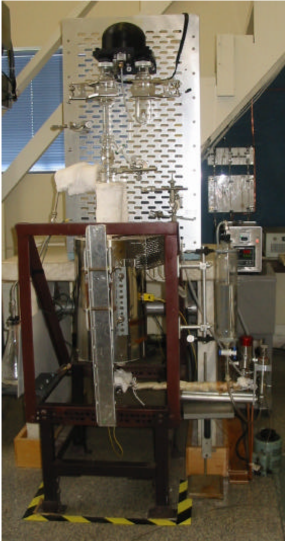
Fig. 2: TGA Apparatus.

atmospheric pressure, and exposure tests in supercritical steam up to 650°C (1202°F) and 34.5 MPa (5000 psi). The atmospheric pressure tests, combined with supercritical exposures at 13.8, 20.7, 24.6, and 34.5 MPa (2000, 3000, 4000, and 5000 psi) are designed to determine the effect of pressure on the oxidation process.