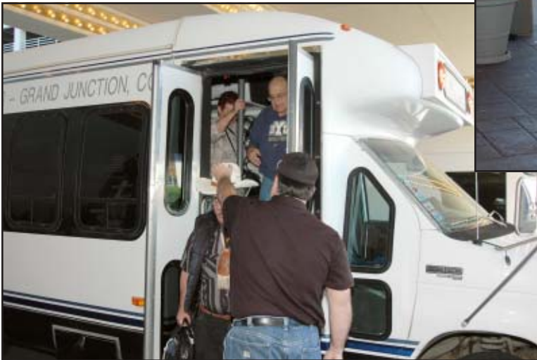
Festival participants arriving at the hotel in Denver.