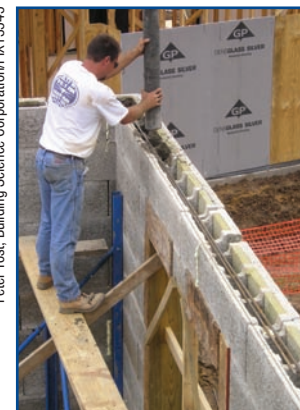
The wood fiber-cement block was selected for its ability to handle moisture in the building enclosure.

engineered wall assemblies, and painstaking attention to moisture control details.