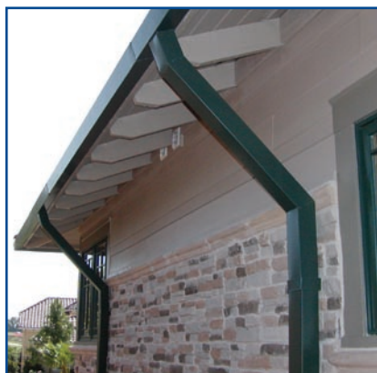
Durability is all in the details—wrap-around overhangs, recessed windows, fibercement siding and trim, gutters, bath exhaust vents.