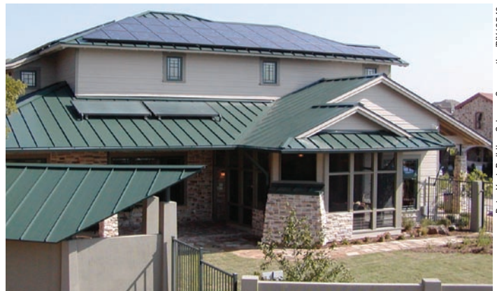
Great unobstructed southern exposure for the photovoltaic and solar water panels, the “engines” of this Zero Energy Home.

See the North Texas Zero Energy Home analysis on the Building Science Corporation Web site at www.buildingscience.com for more detailed information and discussion on the energy performance of this home.