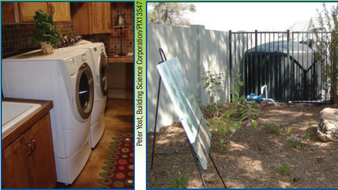
From the inside—H-axis clothes washer—to the outside—rainwater cisterns—this home is a water miser.