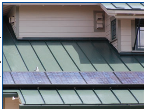
Outside air intakes are neatly tucked under a second story eave.

Building America Zero Energy Home of North Texas will long stand as a testament to durability, with its ventilated claddings,