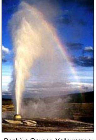
Beehive Geyser, Yellowstone National Park, Idaho, Montana, Wyoming