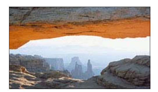
Mesa Arch, Island in the Sky District Canyonlands National Park, Utah

I am looking forward to seeing you again in Budapest! Take care, Kati