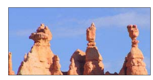
Trio of Hoodoos, Bryce Canyon National Park, Utah