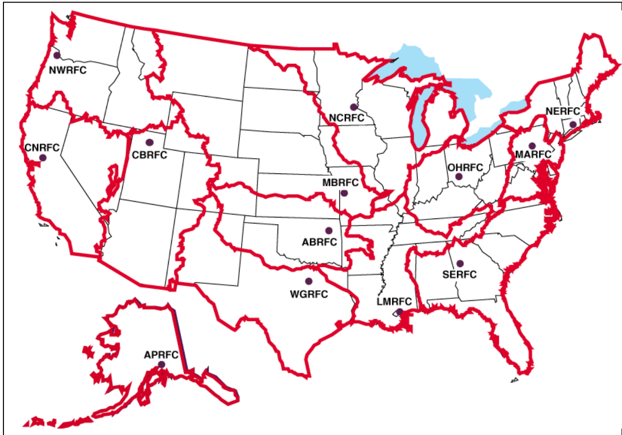
Figure 1. River forecast center areas of responsibility.

excluding the Tennessee River mainstem; and all drainage below Kentucky Dam; the Arkansas River basin and tributaries below Pine Bluff, Arkansas; the Red River basin and tributaries below Fulton, Arkansas; and all Gulf of Mexico drainages between and including the Pascagoula River basin in Mississippi west to the Calcasieu River basin in Louisiana.