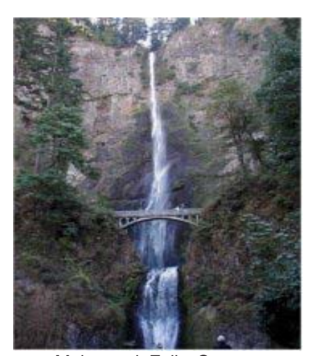
Multnomah Falls, Oregon

I was a bit chagrined to be caught standing in my driveway in that outfit, hollering "G'wan get!"