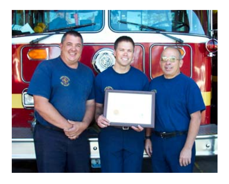
Staff at the Glenbrook Fire Station #5, Tahoe-Douglas Fire District, in Zephyr Cove, NV, receive their award for 25 Years of Service.