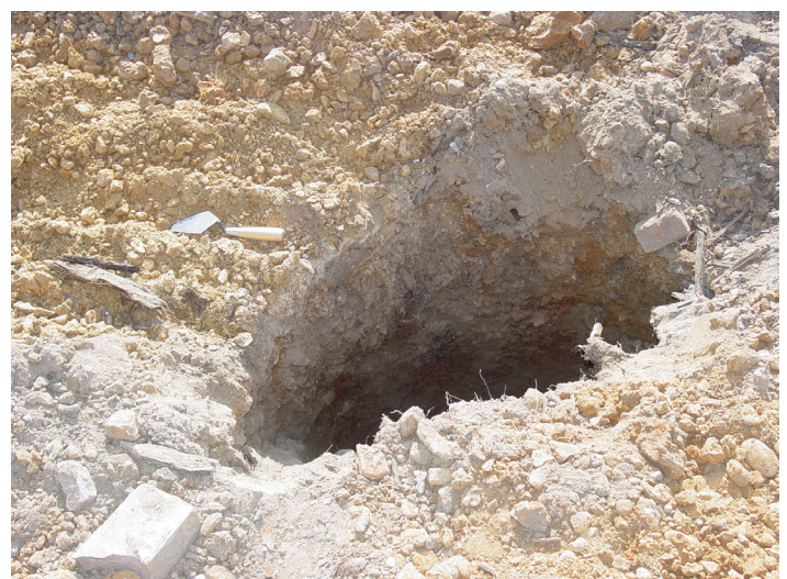
Well uncovered during excavation for the new visitor center foundation.