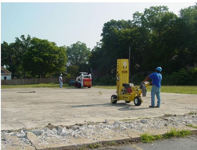
Workers remove the concrete pad on the vacant lot, site of the new visitor center, June 2006.