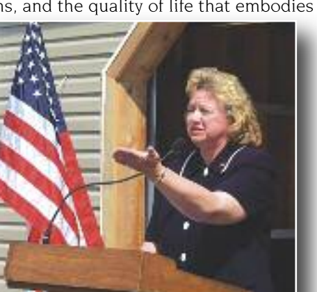
self-help housing subdivision, Lincoln, DE