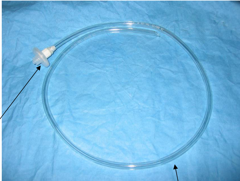
OFP Filter (7501355)

Photograph depicting the OFP Filter (7501355) and OFP Irrigation Tube (7501669)