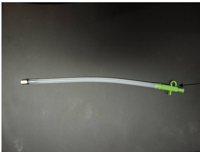
Olympus Washing Tube (MH-974)

General Information: Tubing design may have contributed to the reported event. Both of the tubings, while different in diameter and length, have green connectors. The green connector on the Washing Tube (MH-974) has one less wing than the green connector on the Auxiliary Water Tube (MAJ-855). See photographs of the tubings below, which show the connectors. NOTE: The manufacturer uses green connectors to indicate that the tubing is to be reprocessed, not discarded.