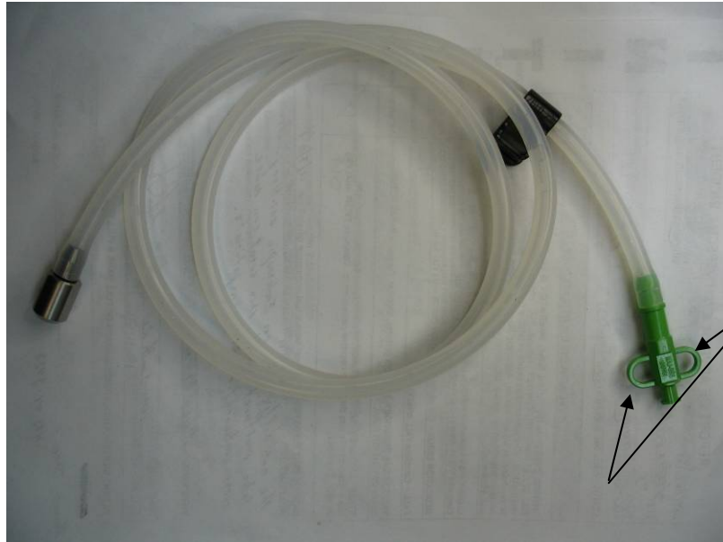
Olympus Auxiliary Water Tube (MAJ-855)

Its green connector with one-way valve has 2 wings.