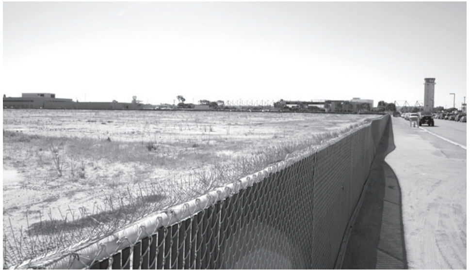
Figure 2: South-Facing View of California Least Tern Nesting Area Near Hangars and Other Facilities