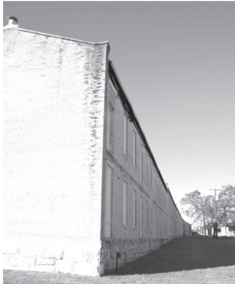
Figure 3: Long Barracks at Fort Sam Houston

and because the associated buildings require extensive, costly renovations.