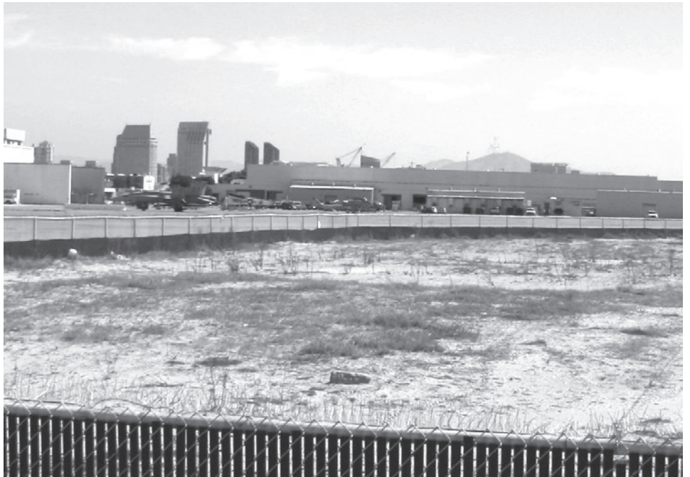
Figure 1: North Side of California Least Tern Nesting Area at Naval Air Station North Island, California, Adjacent to Maintenance Facilities