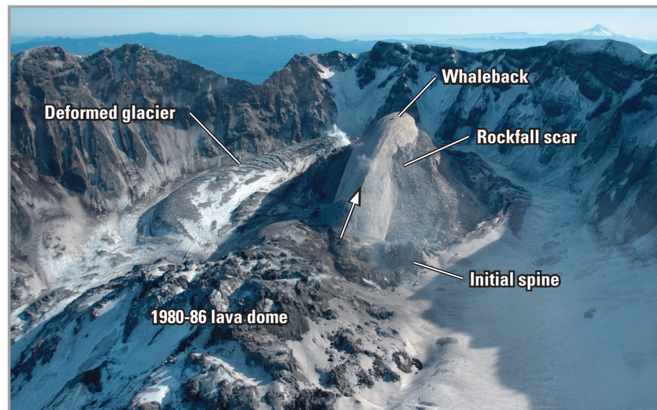
View to southeast of Mount St. Helens' crater. A whaleback-shaped extrusion (part of the new lava dome) emerges from the ground and moves southward (arrow). As it grows southward its edges fracture and crumble, creating a broad apron of blocky debris, over which the extrusion continues to move. Note how the glacier to east is being squeezed and fractured by the growing lava dome. (USGS photo, February 22, 2005)

Deformation associated with intrusion of magma and extrusion of the new lava dome cleaved the crater glacier into two arms. The eastern arm of the glacier, pinched between the new lava dome and the east crater wall, bulged, fractured,