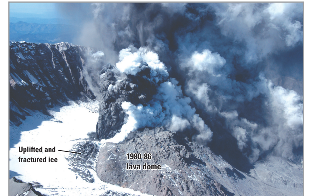
View westward of the steam-and-ash explosion of October 1, 2004. Note the dark-colored ash and white steam emerging simultaneously from a vent through the glacier. Also note the fractured and slightly uplifted glacier ice immediately east of the vent and south of the 1980-1986 lava dome.

After 18 years of relative quiescence, Mount St. Helens volcano recaptured the world's attention when it showed signs of reawakening in September 2004. On September 23 a swarm of small (less than magnitude (M) 0), shallow (less than 1.5 miles below the surface) earthquakes began in and beneath the 1980-1986 lava dome. Initially this swarm resembled previous swarms that had not led to