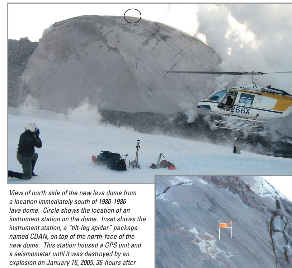
View of north side of the new lava dome from a location immediately south of 1980-1986 lava dome. Circle shows the location of an instrument station on the dome. Inset shows the instrument station, a "tilt-leg spider" package named CDAN, on top of the north-face of the new dome. This station housed a GPS unit and a seismometer until it was destroyed by an explosion on January 16, 2005, 36-hours after placement.

The 2004-2005 dome-growth eruption has been benign so far compared to the May 18, 1980, eruption. Between October 2004 and March 2005, however, it produced two more notable explosions (January 16 and March 8, 2005) that lofted ash plumes (one to nearly 7 miles above sea level, which drifted hundreds of miles downwind) and hurled rock fragments (to about 1 foot diameter) up to a mile across the crater. Continued growth and occasional collapse of the new lava dome may produce additional small explosions and also avalanches of hot debris that sweep out from the dome. Both explosions and hot rock avalanches can create ash clouds that drift downwind, which can endanger aircraft and affect people on the ground. Hot