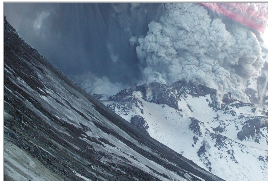
View southwest of Mount St. Helens' crater minutes after onset of the March 8, 2005, explosion. The photograph was taken by a remote camera installed on the "Sugar Bowl" dome at the northeast margin of the crater mouth. The dark cloud to the left consists of a rain of ash and blocks (to about 1 foot diameter) from the eruption plume. The light colored cloud to the right is a plume lofting from a small ash flow moving northward away from the new lava dome. The snow-clad 1980-1986 lava dome is visible in the foreground. The red streaks in the upper right corner are the result of camera imperfections.

See also Mount St. Helens—From the 1980 Eruption to 2000 (USGS Fact Sheet 036-00)