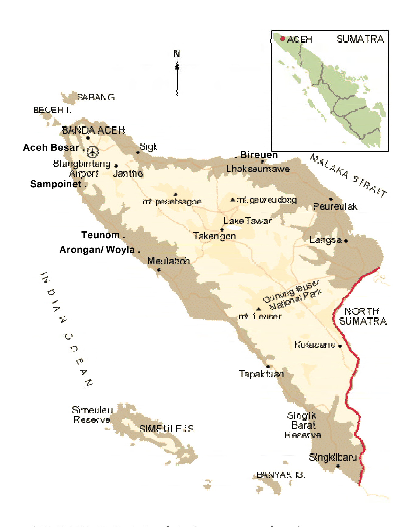
APPENDIX 2: CP Matrix Cumulative (see separate attachment)