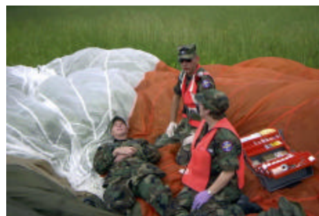
(Continued on page 3)