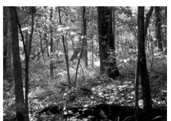
Forests with mature mast-producing trees and a diversity of understory vegetation provide nesting, roosting, and foraging opportunities for wild turkeys.

Wild turkeys roost on the ground and in trees. Tom and hen turkeys without broods roost overnight in trees to avoid predators. Tree roost habitat is found within continuous stands of timber. It is ideally comprised of mature, open-crowned trees with branches spaced at least 18 inches apart that run parallel to the ground, having trunk diameters of 14 inches or greater, and located within one-half mile of a food source. Mature pine, cypress, cottonwood and oak trees can provide good roosting cover. Ground roosting is most critical to hen turkeys during the first three to four weeks of brood-rearing, after which time poults are able to roost in trees with the hen. Hens with young roost under large trees within forests containing a dense understory of young trees and shrubs, downed trees, rock outcrops, and brushy