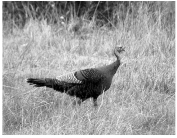
Wildlife Habitat Council