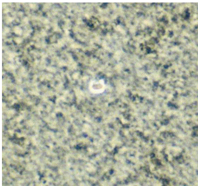
Figure 3. India ink staining of B. anthracis

d) After the ink diffuses across, view the cells using 100X oil immersion objective with oil on top of the cover glass.