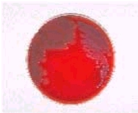
Figure 1. B. anthracis and B. cereus colony morphology. Overnight cultures of B. cereus (left side of plate) and B. anthracis (right side) on SBA.

6.a.3. When examining primary growth media, it is important to compare the extent of growth on SBA plates with that on MacConkey agar plates. B. anthracis grows well on SBA, but does not grow on MacConkey agar. B. anthracis grows rapidly; heavily inoculated areas may show growth within 6-8 h and individual colonies may be detected within 12-15 h. This trait can be used to isolate B. anthracis from mixed cultures containing slower-growing organisms.