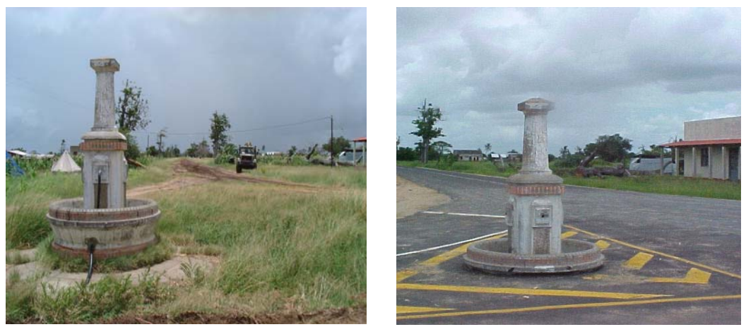
Above are photos of the EN211 road segment taken at a water fountain in Nova Mambone, Mozambique. The pre-reconstruction photo on the left was taken in November 2001 and the post-reconstruction photo on the right was taken in February 2004.

In response to Recommendation No. 2, the Mission has taken corrective action to justify final action on this recommendation. This required that the Mission conduct a current performance evaluation of the two engineering consulting firms