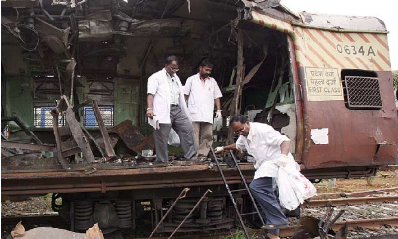
INDIA, Mumbai: Indian forensic experts collect samples from a damaged coach at the site of a bomb blast, at Kandivli in Mumbai, 12 July 2006. The death toll from a wave of coordinated blasts on commuter trains in India's financial capital of Mumbai has risen to 174 with 485 people injured, police said.

India continued to allege that the United Liberation Front of Assam (ULFA) and other anti-India insurgency groups operated from Bangladesh with the concurrence of senior Bangladeshi government officials. The Government of Bangladesh strongly denied these allegations. Nonetheless, the arrest in India of two Pakistanis linked to the Mumbai train bombings who allegedly entered India from Bangladesh underscored how porous the Indo-Bangladeshi border is. The absence of counter-terrorism cooperation between India and Bangladesh fueled mutual allegations that each country facilitated terrorism inside the borders of the other.