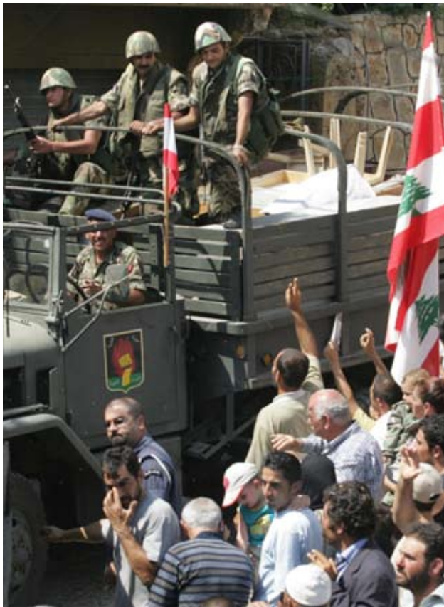
LEBANON, Shebaa: Lebanese troops are welcomed by civilians upon their arrival to the Lebanese village of Shebaa, 18 August 2006.