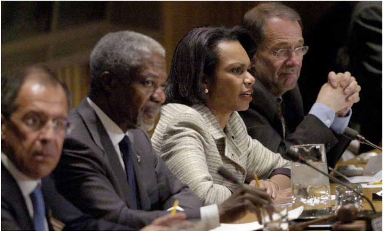
UNITED NATIONS, New York: US Secretary of State Condoleezza Rice (2R) speaks at a press conference of the Middle East Quartet group with Russian Foreign Minister Sergei Lavrov (L), United Nations Secretary General Kofi Annan (2L) and Javier Solana (R), European Union High Representative for the Common Foreign and Security Policy, 09 May 2006 at UN headquarters.