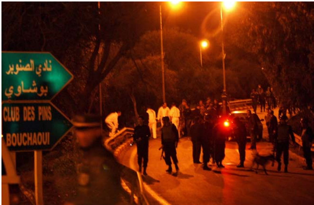
ALGERIA, Algiers: Algerian security and explosives experts check the area 10 December 2006 after a bomb attack on two buses carrying staff of a US company killed one Algerian driver and injured nine other people from the US, Britain, Lebanon, Canada and Algeria in the neighborhood of Staoueli.

For the majority of 2006, the security situation in Algeria remained relatively unchanged, marked by stability in the major urban areas and low-level terrorist activities in the countryside. The last quarter of the year, however, witnessed four attacks in the province of Algiers, including one that targeted Westerners. These were the first attacks inside the province since 2004. Until these recent attacks,