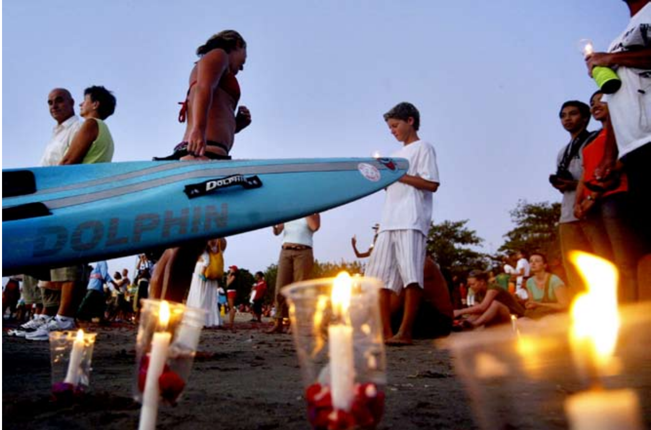
INDONESIA, Denpasar: Locals and foreign tourists light candles at the Kuta beach in Denpasar, on Bali Island, 12 October 2006, in remembrance of the 2002 Bali Bombing victims.

The security situation in the previously strife-torn Maluku region improved, absent major incidents of interfaith violence. In central Sulawesi, where terrorist attacks in 2005 claimed several lives, a special taskforce led by the INP's top CT investigators identified and arrested several JI-linked terrorists responsible for the October 2005 Poso schoolgirl beheadings and other previously unresolved cases. The three main suspects arrested in April were brought to trial in Jakarta. In September, several days of street violence in Indonesia's eastern provinces followed the executions in Palu of three Christian men for their role in inciting deadly attacks against Muslims in 2000. However, the perpetrators behind the October shooting death of a Christian priest in Palu remained at large. Also at large were more than two dozen terrorist suspects in central Sulawesi who continued to evade INP investigators. The INP feared aggressive police operations would provoke the militants, and, in November, the INP unsuccessfully sought cooperation from the suspects' families to encourage the suspects to surrender.