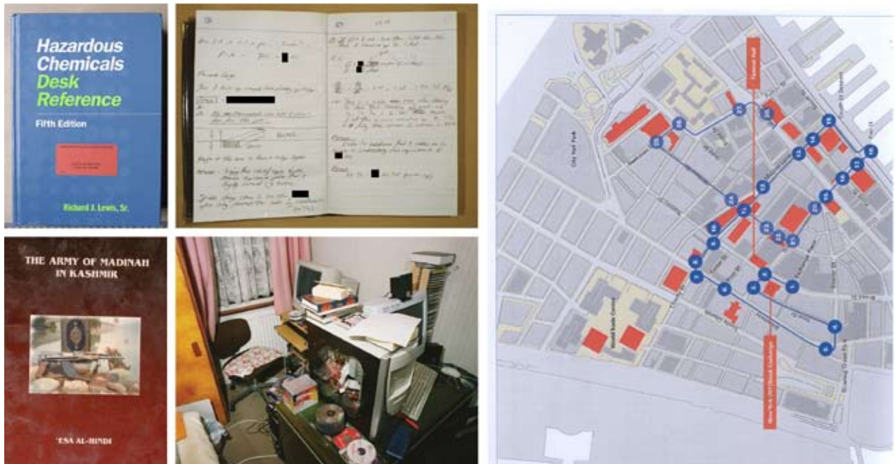
UNITED KINGDOM, London: A combination of handout images obtained 08 November 2006 from Britain's Metropolitan Police shows books, notes, maps and a room used by British al-Qaida terrorist Dhiren Barot.

At the June 2004 U.S. - EU Summit, the sides agreed on a Declaration on Combating Terrorism that renewed the transatlantic commitment to develop measures to maximize capacities to detect, investigate and prosecute terrorists, prevent terrorist attacks, prevent access by terrorists to financial and other economic resources, enhance information sharing and cooperation among law enforcement agencies, and improve the effectiveness of border information systems. These commitments were reconfirmed at the 2006 Summit and work continued on implementation.