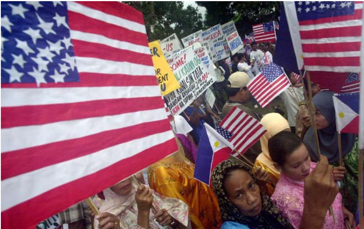
PHILIPPINES, Jolo: Protesters holding US and Philippine flags hold a pro-Balikatan rally in Jolo, 11 February 2006, in support of a counterterrorism exercise by US and Philippine troops.

reluctance to investigate or charge vendors or users of false documents. Under current Philippine law, the suspect must present the fraudulent document to a Philippine government authority in order for a crime to have been committed. At year's end, a counterterrorism bill approved in April by the House of Representatives remained in the Senate.