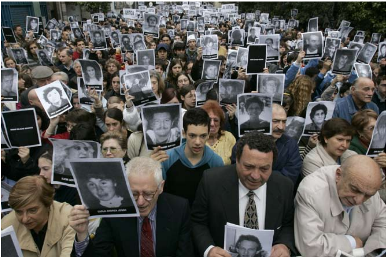
ARGENTINA, Buenos Aires: A minute's silence in commemoration of the 12th anniversary of the terrorist bombing against the Argentine-Israeli Mutual Association (AMIA) which killed 85 and injured over 200 people, in Buenos Aires, 18 July 2006.

Hizballah and Iran remained the chief suspects for the July 18, 1994 terrorist bombing of the Argentine-Israeli Mutual Association (AMIA) that killed 85 and injured over 200 people. On October 25, AMIA special prosecutors issued an 801-page indictment charging eight Iranian government officials and one member of Hizballah with the attack. 15 On November 9, Judge Canicoba-Corral ratified the indictments and maintained charges against former Iranian Ambassador Soleimanpour. The judge issued arrest warrants and on November 15, the Argentine government transmitted a request to INTERPOL for new Red Notices for the nine suspects. The year ended with action in INTERPOL pending.