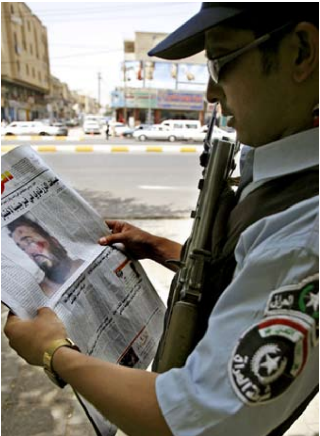
IRAQ, Baghdad: An Iraqi policeman reads a newspaper with the picture of killed al-Qaida leader in Iraq, Abu Musab al-Zarqawi, published on the front page in central Baghdad, 10 June 2006.