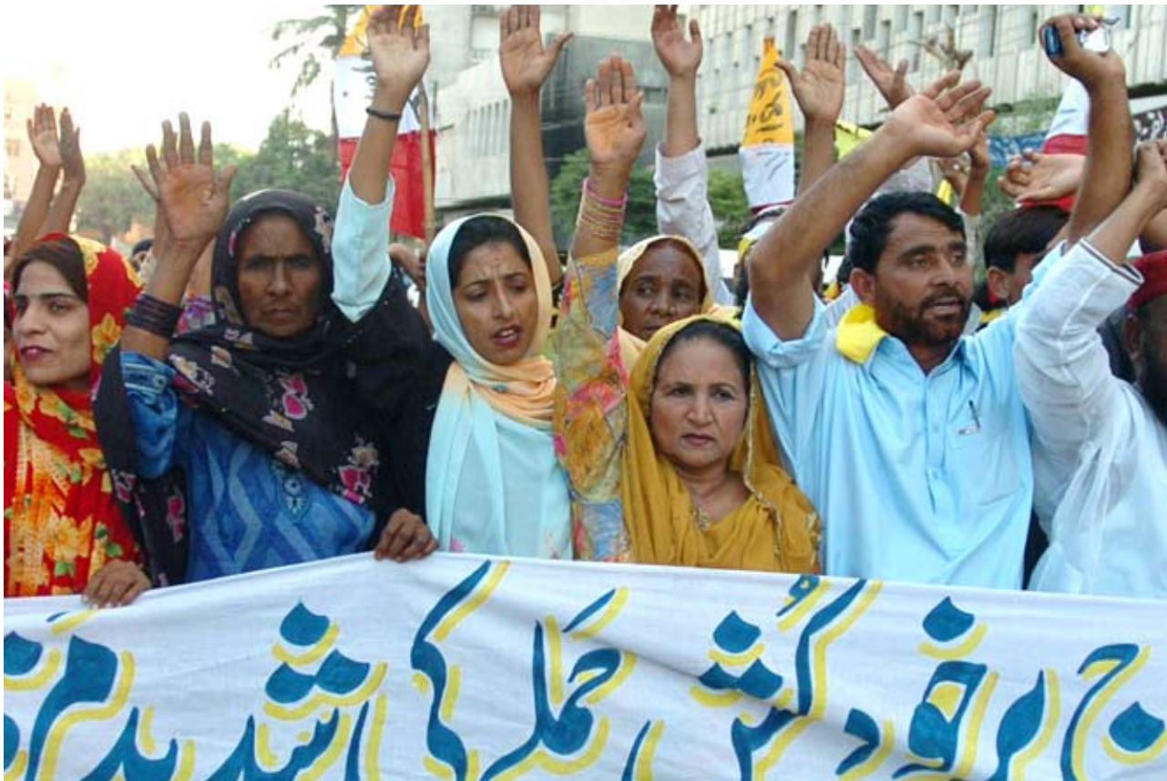
PAKISTAN, Karachi: Pakistani NGO workers shout slogans against the suicide attack on an army training camp during a demonstration in Karachi, 12 November 2006. Protesters condemned the suicide attack which killed 42 soldiers at an army base in northwest Pakistan 08 November 2006.

sectarian strife and militant sub-nationalists. Attacks occurred with greatest frequency in the regions bordering Afghanistan: Balochistan, the North West Frontier Province (NWFP), and the adjacent Federally Administered Tribal Areas (FATA).