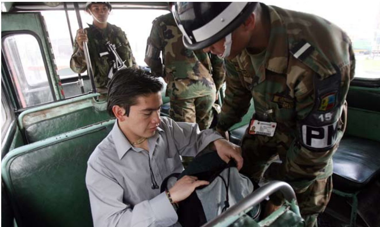
COLOMBIA, Bogota: A soldier searches the shoulder bag of a man inside a bus in Bogota 06 August, 2006, as part of the security operations on the eve of President Alvaro Uribe's second term inauguration. Car bombings have rocked a number of Colombian cities in what authorities have called a wave of attacks by the rebel Revolutionary Armed Forces of Colombia (FARC), ahead of the second-term inauguration of Uribe.