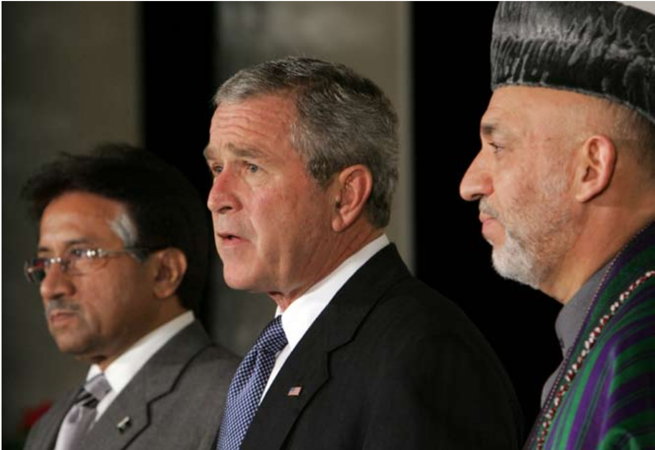
UNITED STATES, Washington: US President George W. Bush ( C) speaks beside Afghan President Hamid Karzai ( R) and Pakistan President Pervez Musharraf (L) in the Rose Garden following a meeting in the Oval Office of the White House on 27 September 2006 Washington, DC.

the elected Government of Lebanon and roll back progress toward democratization in the Middle East. Syria also supports some Iraqi Baathists and militants and has continued to allow foreign fighters and terrorists to transit through its borders into Iraq.