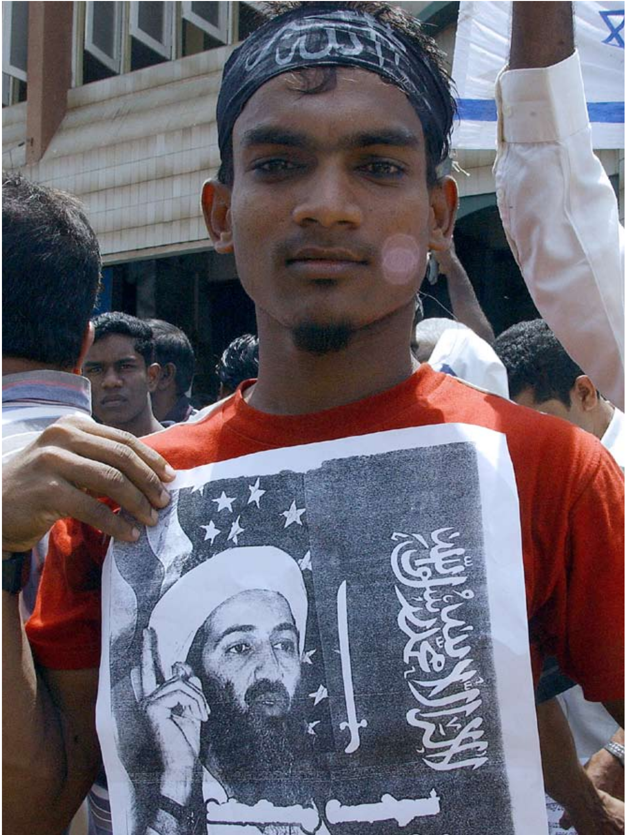
SRI LANKA, Colombo: A Sri Lanka demonstrator carries a placard showing Al-Qaeda chief Osama bin Laden during a demonstration in Colombo 21 July 2006.