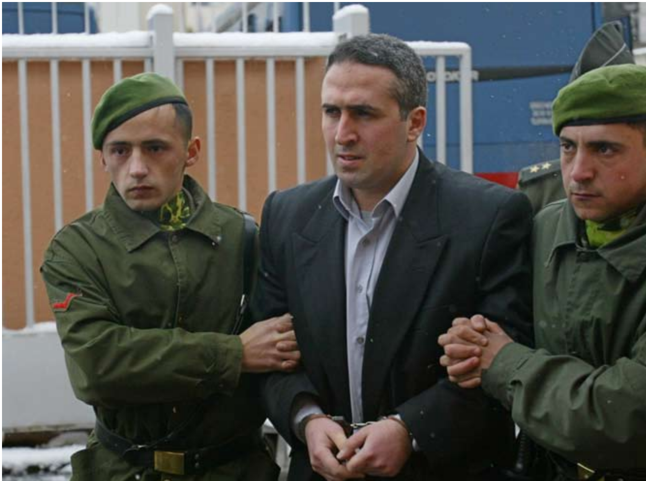
TURKEY, Istanbul: Yusuf Polat ( C ), one of the 30 defendants charged with four massive suicide attacks in Istanbul in November 2003, is escorted by Turkish gendarmes 24 January 2006 upon his arrival at an Istanbul courthouse. The two sets of car bombings, the worst terrorist incidents in Turkish history, targeted two synagogues 15 November 2003, the British Consulate and the British-based HSBC bank 20 November 2003, killing 63 people, including British Consul Roger Short.

In addition to sharing intelligence information on various groups operating in Turkey, the Turkish National Police (TNP) and the National Intelligence Organization (MIT) conducted an aggressive counterterrorist campaign and detained numerous suspected terrorists in scores of raids, disrupting these groups before terrorist acts could be carried out. For example, in December, TNP counterterrorism units simultaneously raided ten addresses in Istanbul that were suspected of housing leftist militants. Twenty suspects were arrested. Turkish law defined terrorism as attacks against Turkish citizens and the Turkish state, and government left the definition unchanged when Parliament enacted a package of amendments to its antiterrorism law.