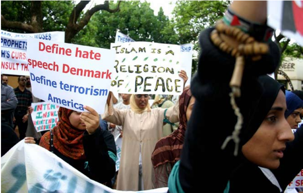
SOUTH AFRICA, Pretoria: Hundreds of Muslims protested outside the Danish Embassy in Pretoria 10 February 2006 demanding an "immediate and unwavering" apology from the Danish Government to the global Muslim community.