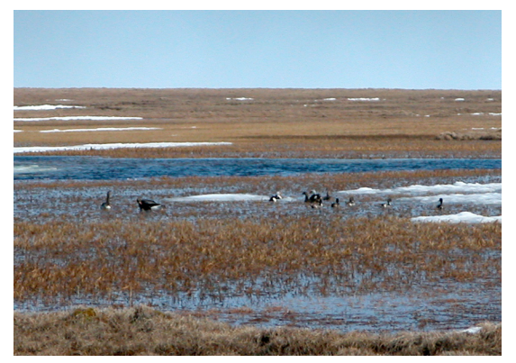
Mixed flock of waterfowl on Arctic Refuge coastal plain.

For more information about visiting Arctic Refuge go to http://arctic.fws.gov/ or call 800-362-4546.