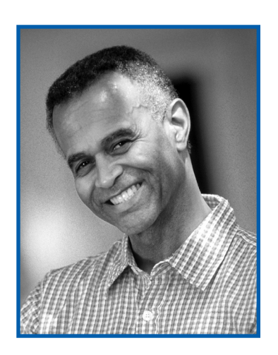
"Oral health is essential to general health and well-being at every stage of life."

A National Call to Action to Promote Oral Health Office of the U.S. Surgeon General