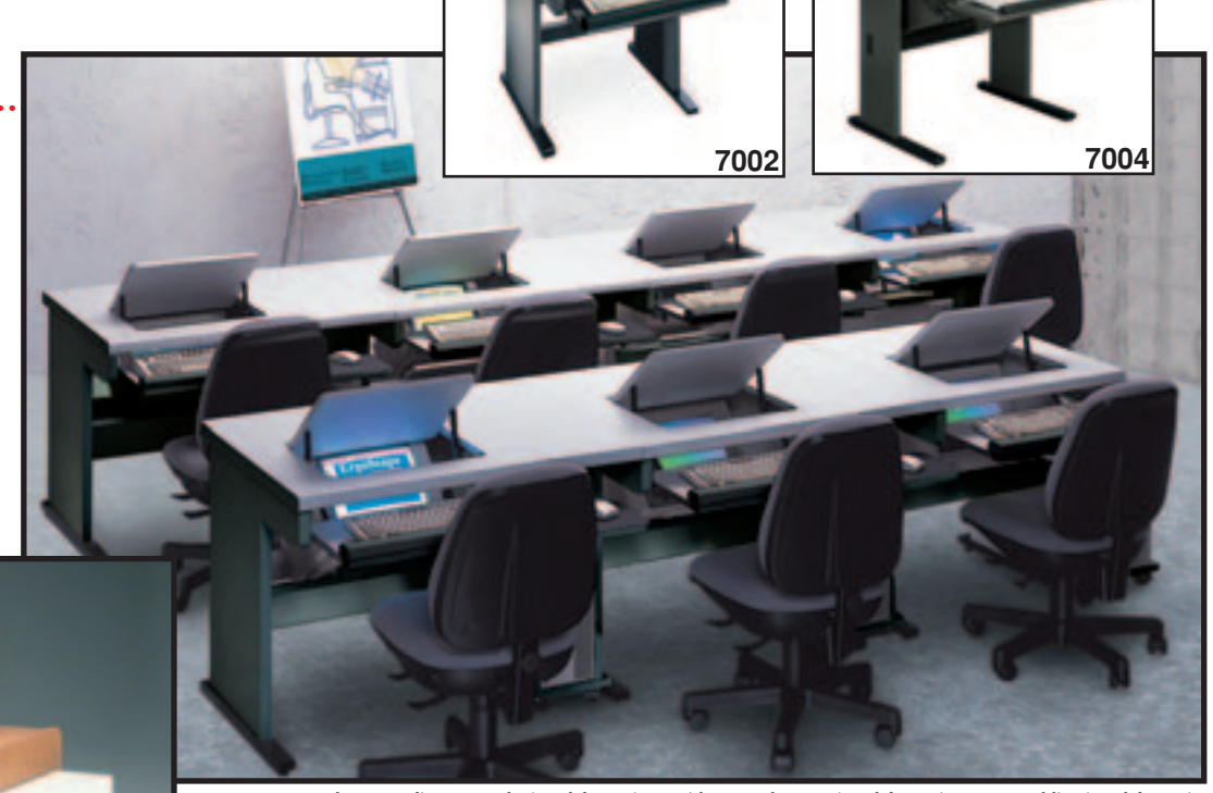
Set-up shown: 7 Flip-Top Desks (Model 7002), 5 Bridge Attachments (Model 7050), 7 CPU Caddies (Model 308S)

GS-29F-0103G Sched. 71 I Office Furniture