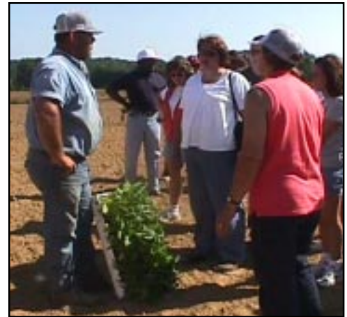
TEACHERS LEARN FROM FARMERS during a KDA field workshop.

The annual Ag Day Poster and Essay Contest during National Agriculture