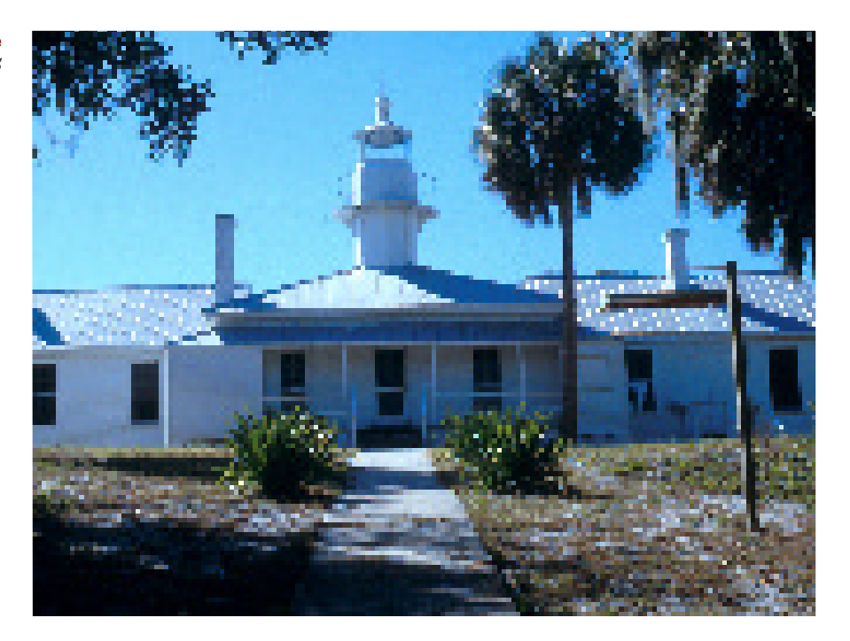
Seahorse Key Lighthouse USFWS