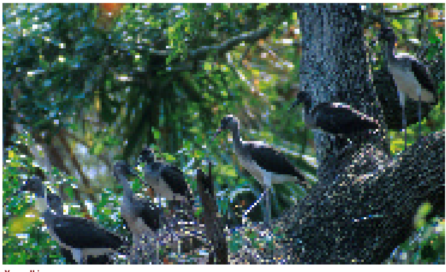
Young Ibis