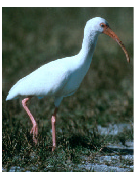
White Ibis

Develop Education Facilities Comments from the public during the scoping process clearly indicated the need for and support of improved environmental education opportunities. The refuge is part of the Aquatic Education Advisory Committee in Cedar Key with Florida's Marine Research facility, the University of Florida, and Levy County Schools. This committee has identified the need for an outdoor classroom facility in Cedar Key, off refuge property. Ideally, it could be located next to the state's research facility, and include a pole shed type structure with