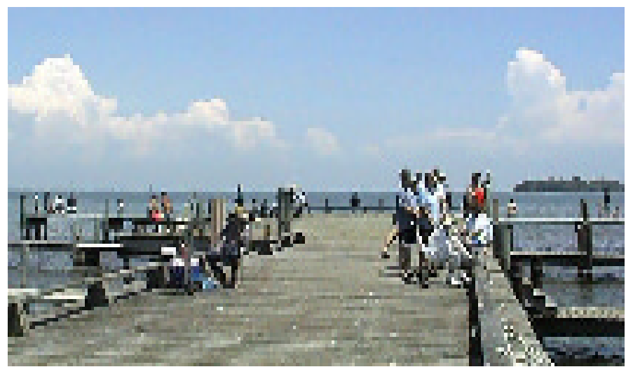
Cedar Keys Pier USFWS Allyne Askins

Once a sleepy fishing village, the town of Cedar Key has become a unique nature tourist and sportfishing destination. The refuge protects island habitat that would possibly be developed to accommodate increased tourism. The seasgrasses surrounding the islands are important for local shell fisheries and provide valuable habitat for manatees and juvenile sea turtles. Seahorse Key is home to one of the largest colonial wading bird rookeries in north Florida.