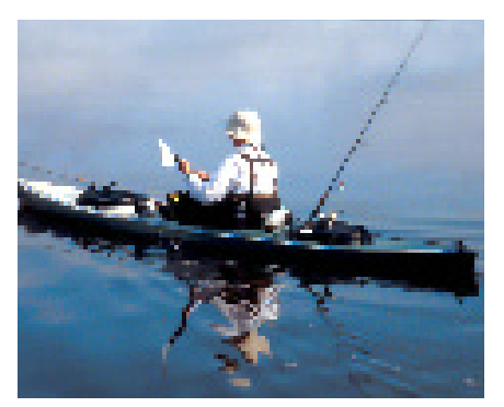
Fishing