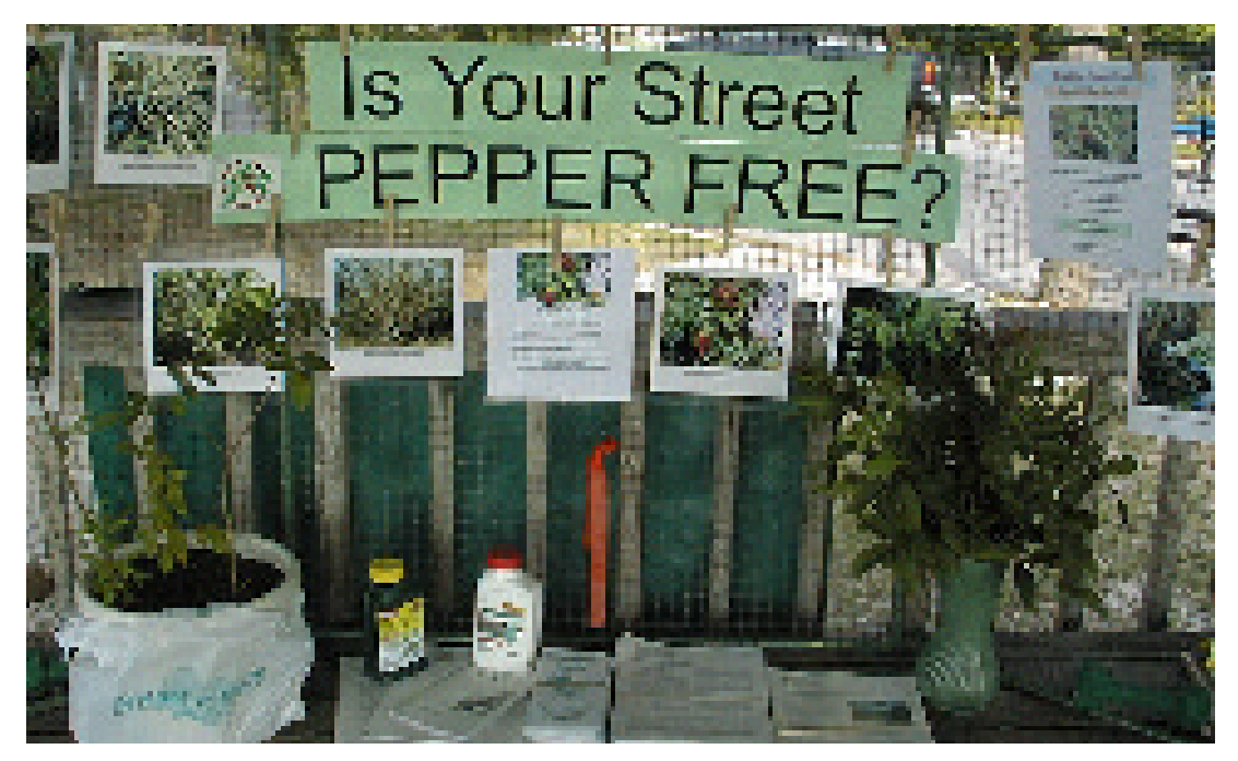
Brazilian Pepper