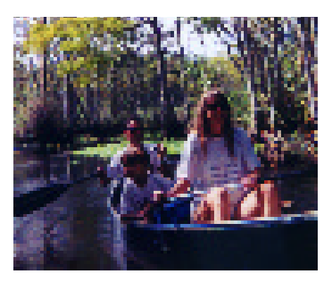
National Wildlife Refuge Week Canoe Tour USFWS