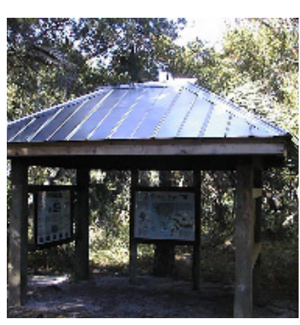
Atsena Otie Kiosk