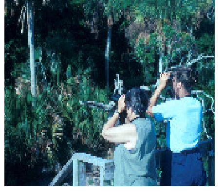
Bird Watching at Cedar Keys