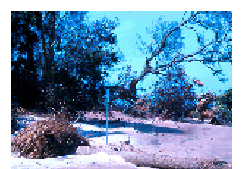
Atsena Otie Beach