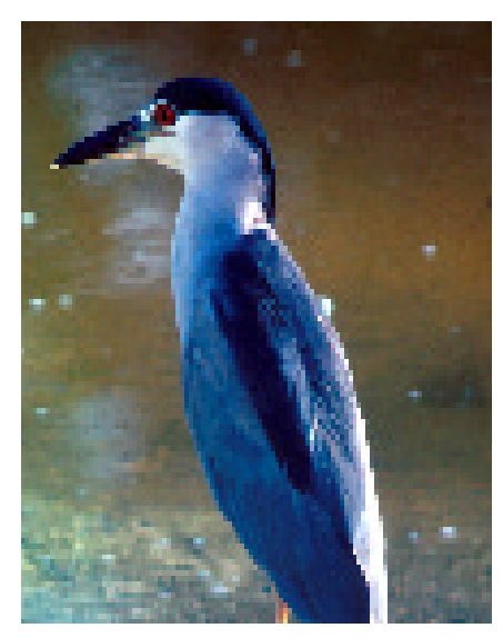
Black-crowned Night Heron

Cedar Keys National Wildlife Refuge was established on July 16, 1929, by Presidential Executive Order 5158, to protect a breeding ground for colonial nesting migratory birds. The Executive Order included North Key, Snake Key, and Bird (Deadman's) Key. A second Executive Order, dated November 6, 1939, added Seahorse Key to the refuge. Congressional legislative mandate number 92-364, dated August 7, 1972, designated Seahorse Key, Snake Key, North Key, and Deadman's Key as National Wilderness Areas under the Wilderness Act of September 3, 1964 (Public Law 88-577). During the late 1970s and 1980s, additional interior coastal islands surrounding the town of Cedar Key were purchased for inclusion in the refuge. In 1998, the Suwannee River Water Management District purchased Atsena Otie Key and added it to Cedar Keys Refuge through a Memorandum of Understanding. Today, Cedar Keys Refuge is comprised of 13 islands ranging in size from 1 to 120 acres and totaling 762 acres.