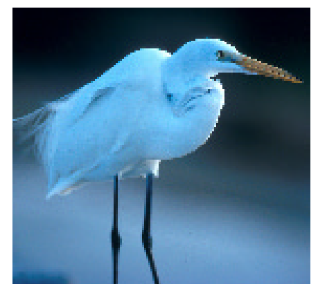
Great Egret