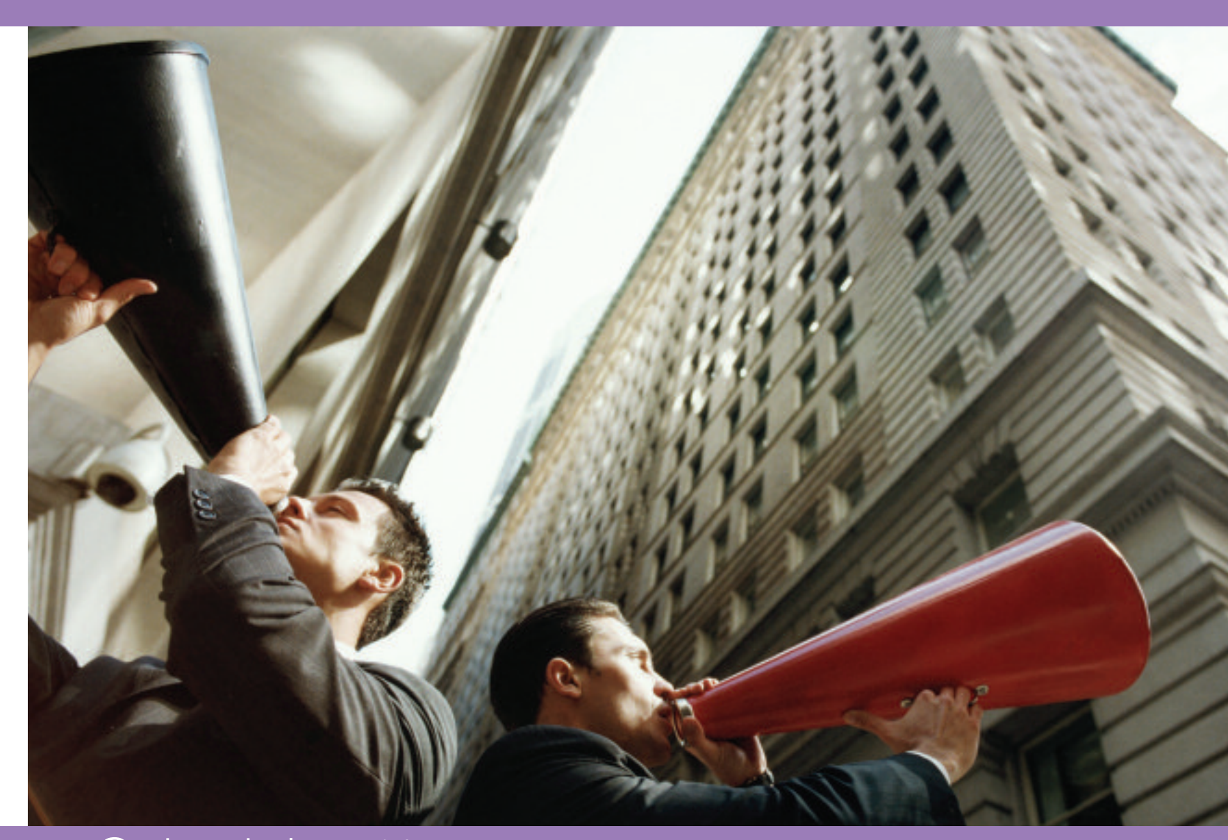
Schedule 541 Make Certain Your Message Is Heard!