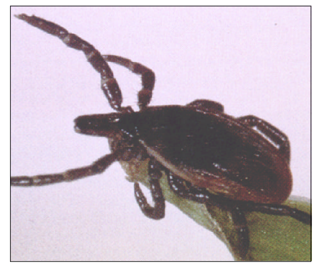
Figure 3. Adult deer tick.

The Feulgen reaction is DNA-specific (15); therefore, it appeared illogical that inclusions of an RNA virus would be specifically stained in our microscopy-based assay. Experimental evidence suggests, however, that glycoproteins may also be stained (16,17) in what is known as the plasmalogen reaction. The inclusions detected in tick salivary glands may, therefore, represent envelope proteins from massively replicating virus.