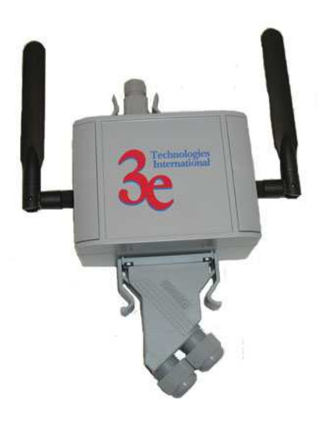
Figure A: 3e-523