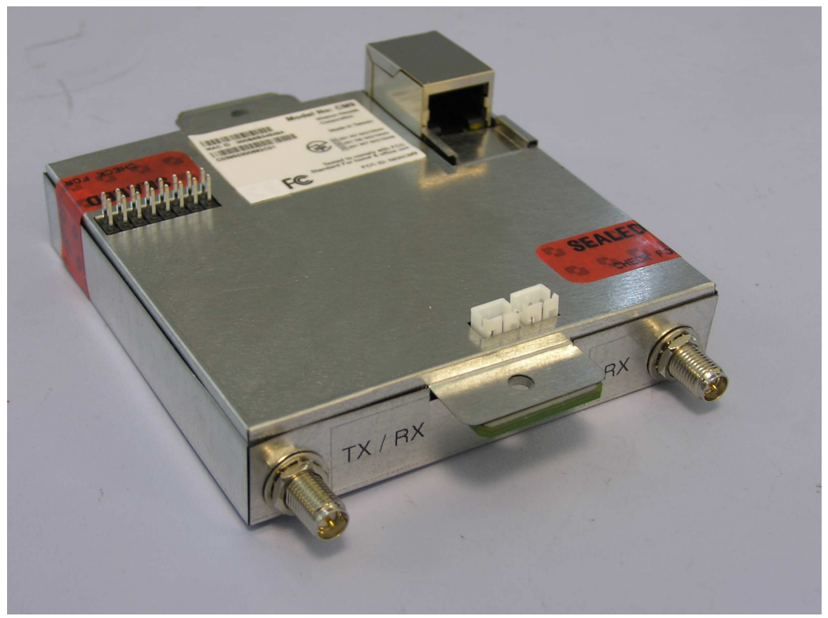
Figure B - 3e-523-F1

The cryptographic module security policy consists of a specification of the security rules, under which the cryptographic module shall operate, including the security rules derived from the requirements of the standard. Please refer to FIPS 140-2 (Federal Information Processing Standards Publication 140-2 — Security Requirements for Cryptographic Modules available on the NIST website at <a href="http://csrc.nist.gov/cryptval/">http://csrc.nist.gov/cryptval/</a>.