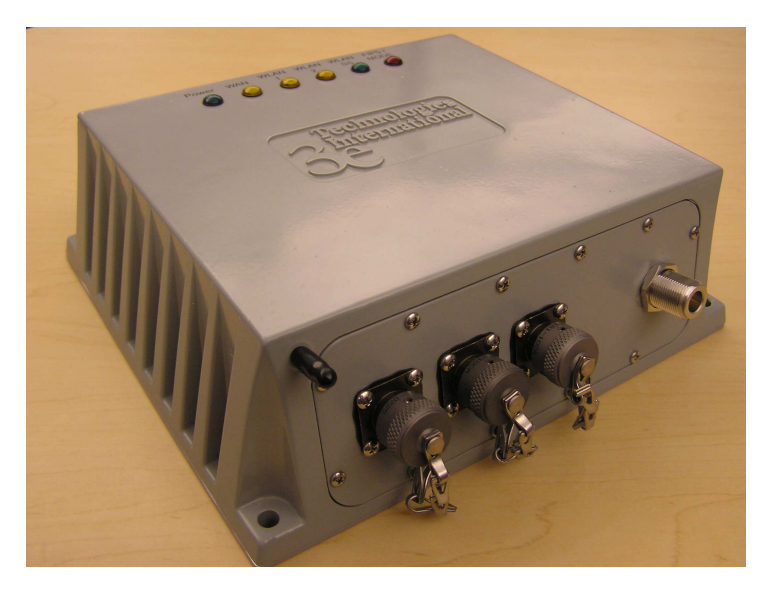
3e-525A Wireless Gateway

The figure below shows the 3e-525A Wireless Gateways.