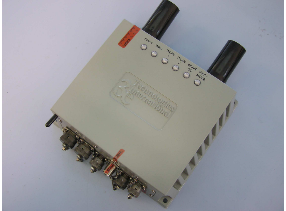
3e-525N Wireless Gateway