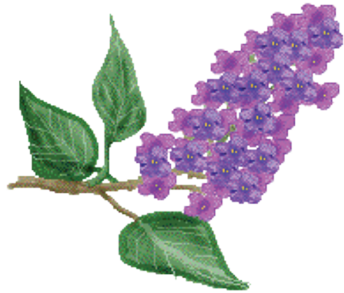
Spokane "The Lilac City"