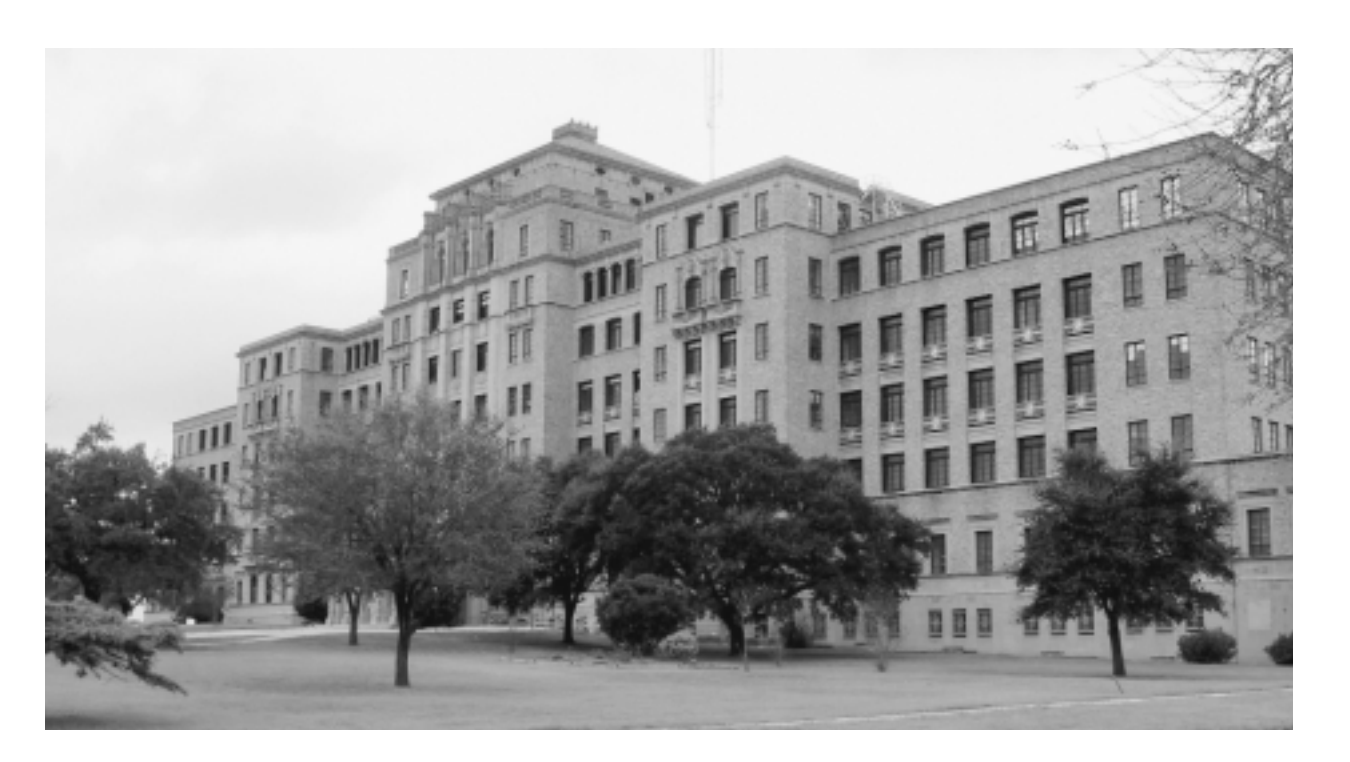
At Brooke Army Medical Center, Fort Sam Houston, Texas, the Department of the Army has partnered with a private developer to reuse several unused historic buildings. Under its enhanced-use leasing authority, the Army will lease back portions for continued military use.

that the General Services Administration is now using in several other leases.