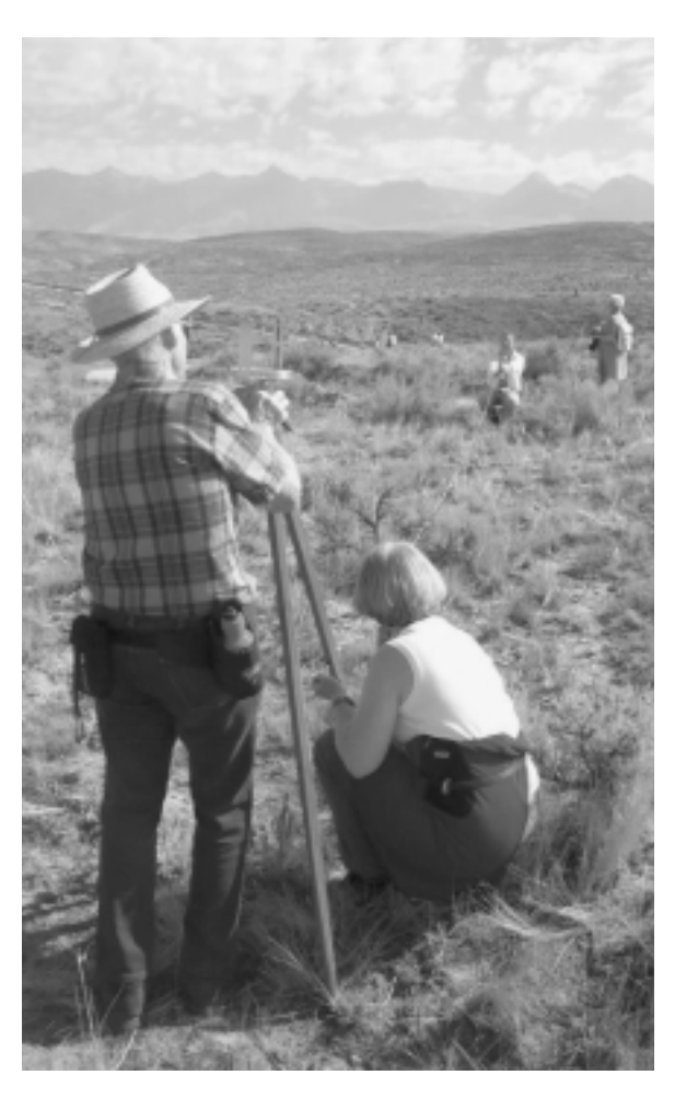
The Forest Service is using fees collected from its Heritage Expeditions program to fund protection of heritage resources. On the Sextants to Satellites expedition in the Salmon-Challis National Forest, participants used historic and modern navigation tools while exploring the Lewis and Clark National Historic Trail.

As the examples discussed above suggest, there are nontraditional-but not unprecedentedsources of funding that can greatly enhance an