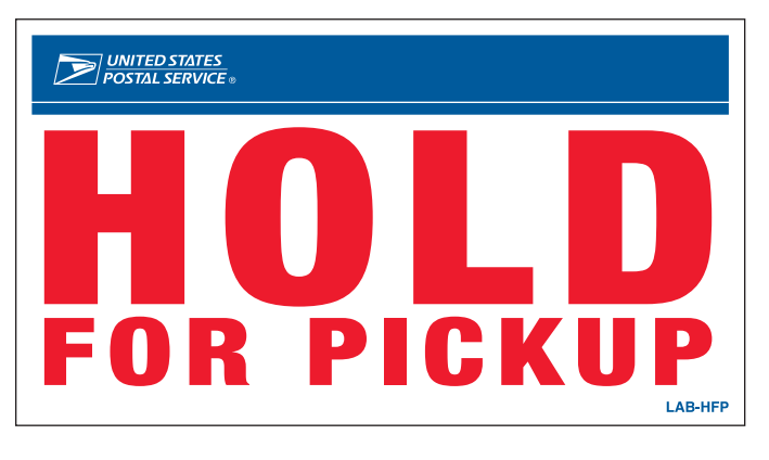
Exhibit 4.6.2e Official Hold For Pickup Endorsement, Label LAB-HFP