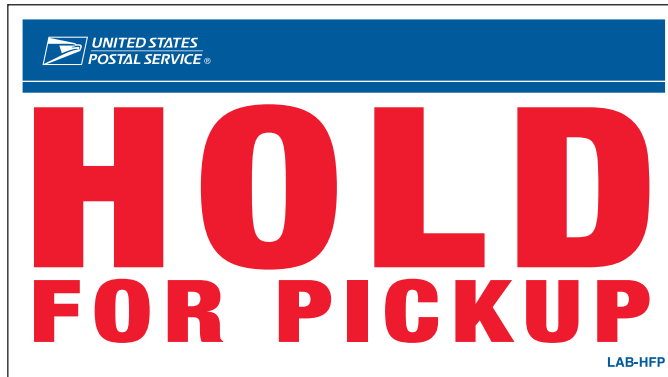
Exhibit 4.1.4e Official Hold For Pickup Endorsement, Label LAB-HFP