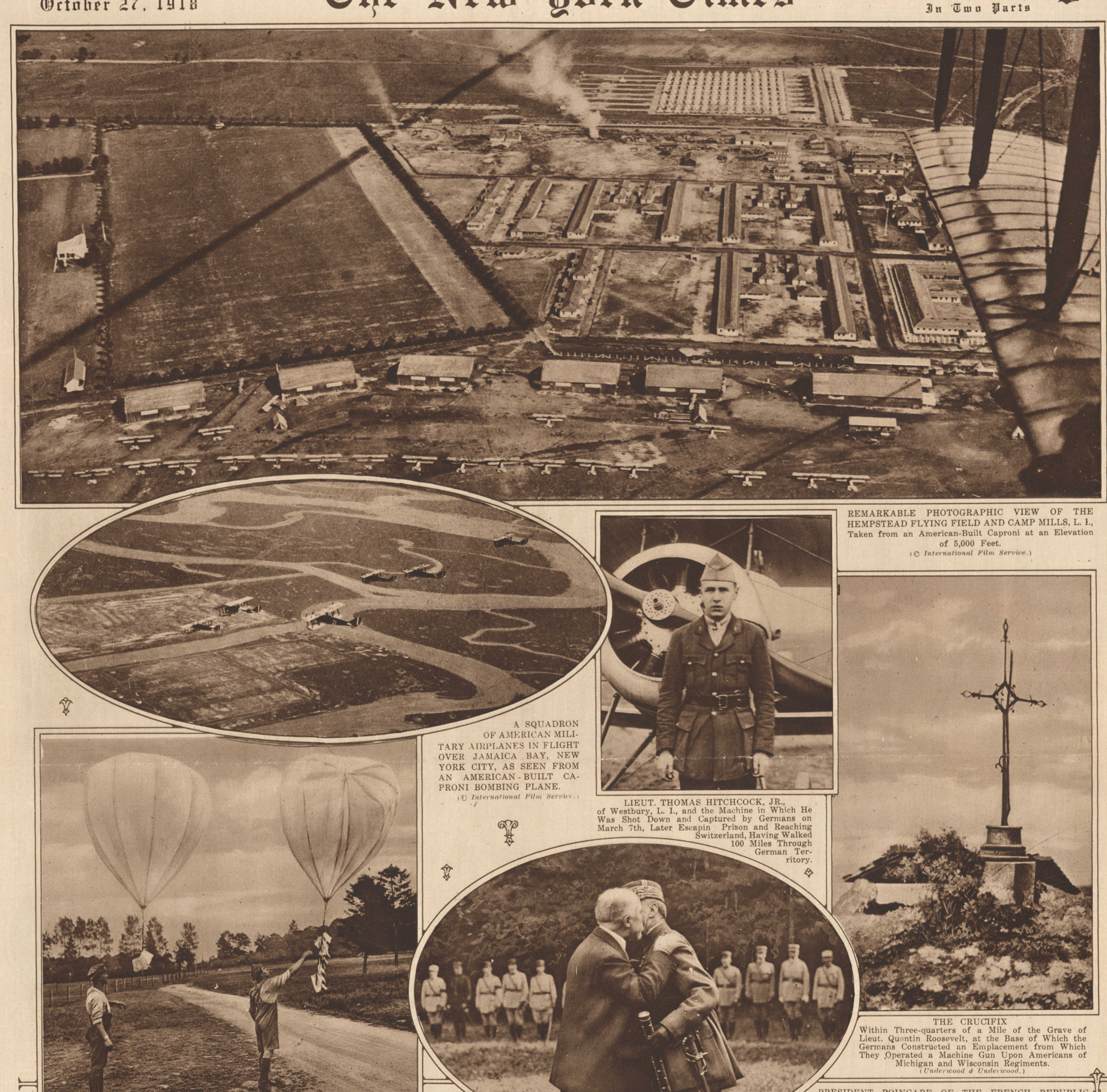
PRESIDENT POINCARE OF THE FRENCH REPUBLIC SALUTING MARSHAL FOCH ON THE RECENT OCCASION OF PRESENTING TO HIM THE BATON OF A MARSHAL OF FRANCE.