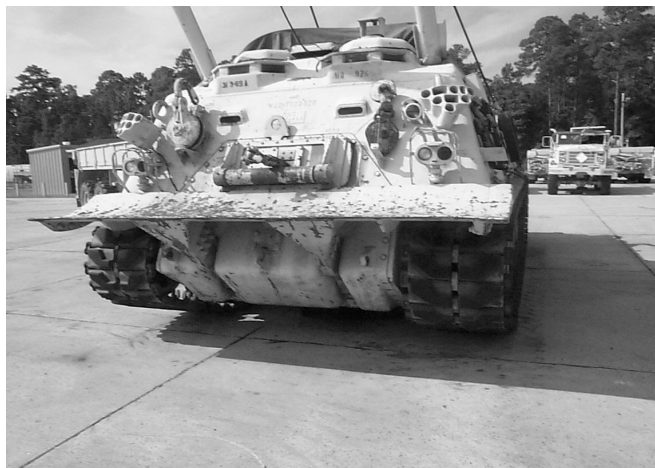
Army armor recovery vehicle