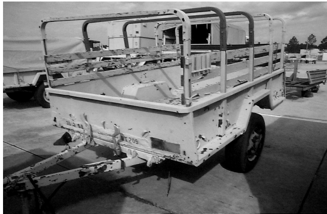
Army utility trailer