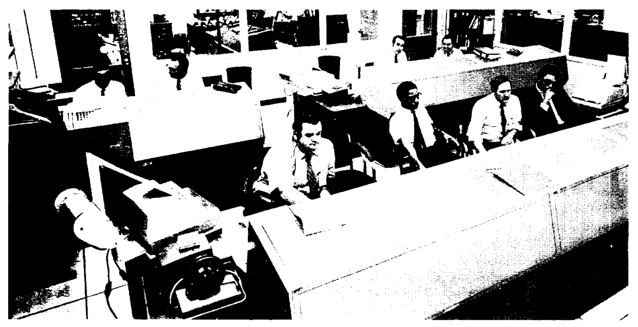
VALIDATION SUPPORT—Flight Support Division engineers are shown as they were validating command, telemetry and tracking data this past week in the Instrumentation Support Team area, during the MSC internal validation.