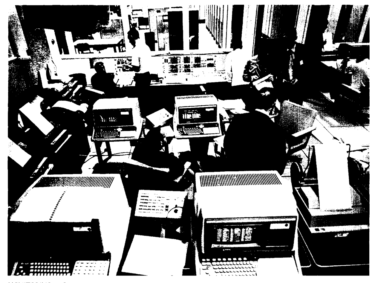
MONITORING—FSD engineers monitor in the Data Control Area of CCATS (communications, command and telemetry systems) to verify the computer is receiving, processing and routing data properly during MCC internal validation last week.