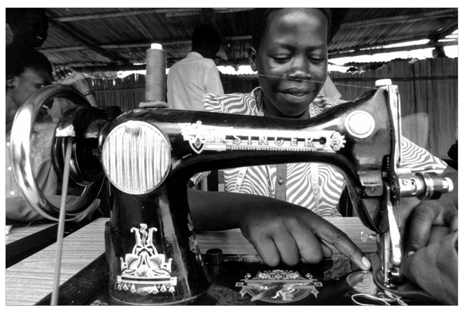
A girl works at a sewing machine, part of a skills training workshop in Uganda.

depend on women since many were not able to resume income-generating activities either because they suffered from disabilities or because institutions that had employed them had collapsed during the war (Gardner and El Bushra 2004). Women's central involvement in livelihood protection makes them key participants in both assisted and unassisted recovery strategies. Appropriate assistance can be targeted for women to help maximize the effectiveness of their livelihood strategies and create employment opportunities for men so that they are able to contribute to the welfare of the household.