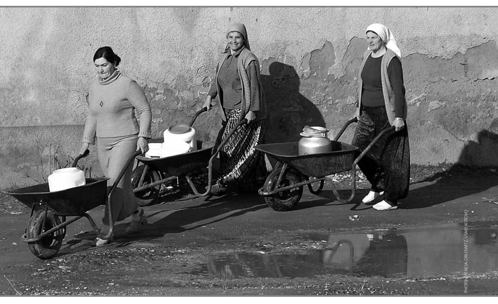
Kosovar women bringing their milk to market.

The following program options have been implemented in conflict situations to protect or enhance household assets. Emphasis has been placed on demonstrating innovative assistance that supports household livelihood-coping strategies in conflict environments. While these interventions represent good starting points for developing new programs, each initiative must be tailored to a region or country's specific economic, political, and security conditions.