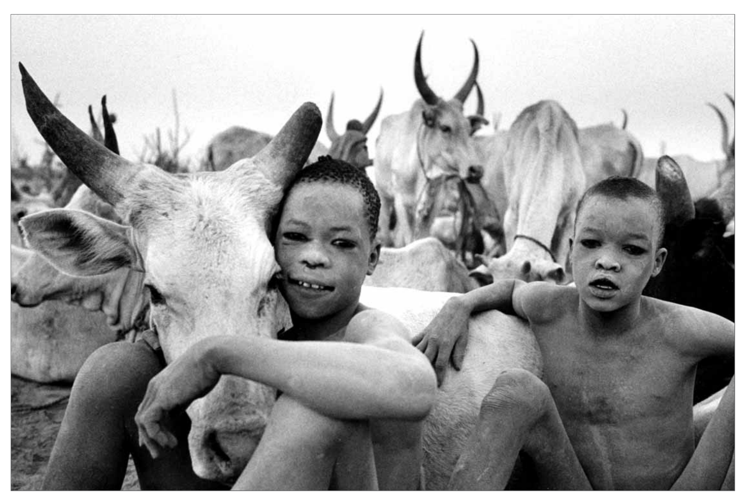
Dinka boys with their cattle.

standard of living as the host community without depleting the (often scarce) resources of the hosts. This may require a "cross-mandate" approach where similar assistance is offered to groups who might not be included in an agency's traditional focus. The community-based assistance approach was tried with considerable success in Central America during the 1980s, and during the early 1990s in Cambodia and Ethiopia.