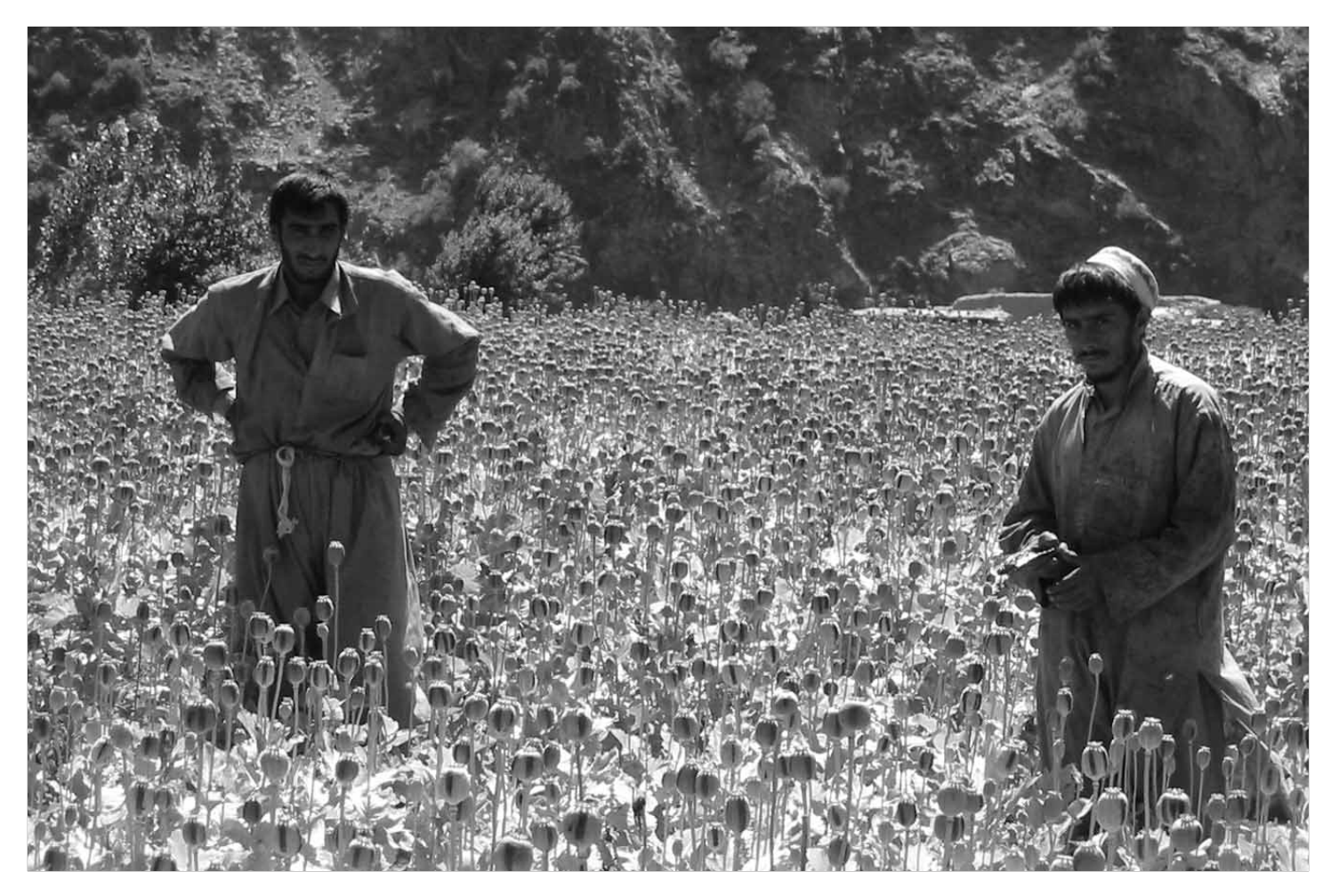
Opium poppy fields in Afghanistan.

Relief assistance will rarely be the only type of intervention needed.