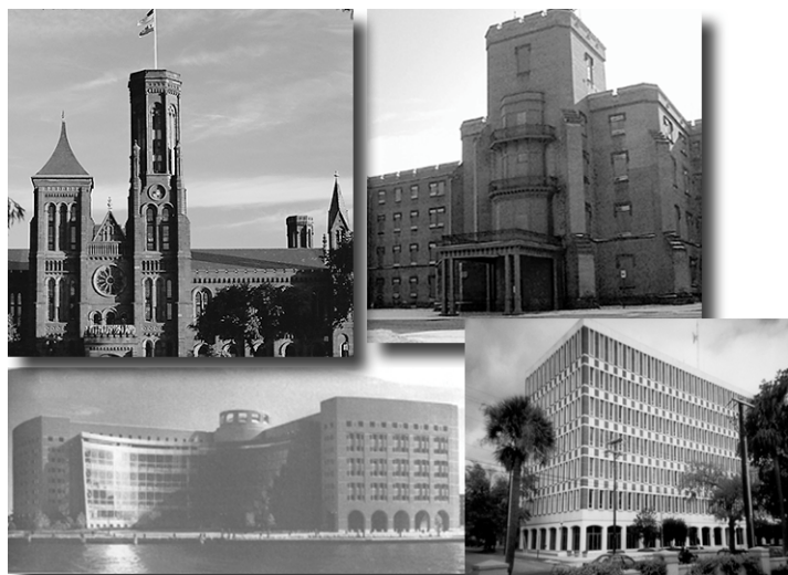
Federal Real Property (clockwise from top left): Smithsonian Institution Building (Washington, D.C.); St. Elizabeths Hospital (Washington, D.C.); L. Mendel Rivers Federal Building, (Charleston, SC); and John Joseph Moakley U.S. Courthouse (Boston, MA).

GSA recognizes the problems and has actions under way to help resolve them, such as developing real-time database capabilities and proposing legislation to improve the inventory. Given past problems GSA has experienced and the many players involved with this effort, a well-formulated plan for making improvements will be a critical necessity.